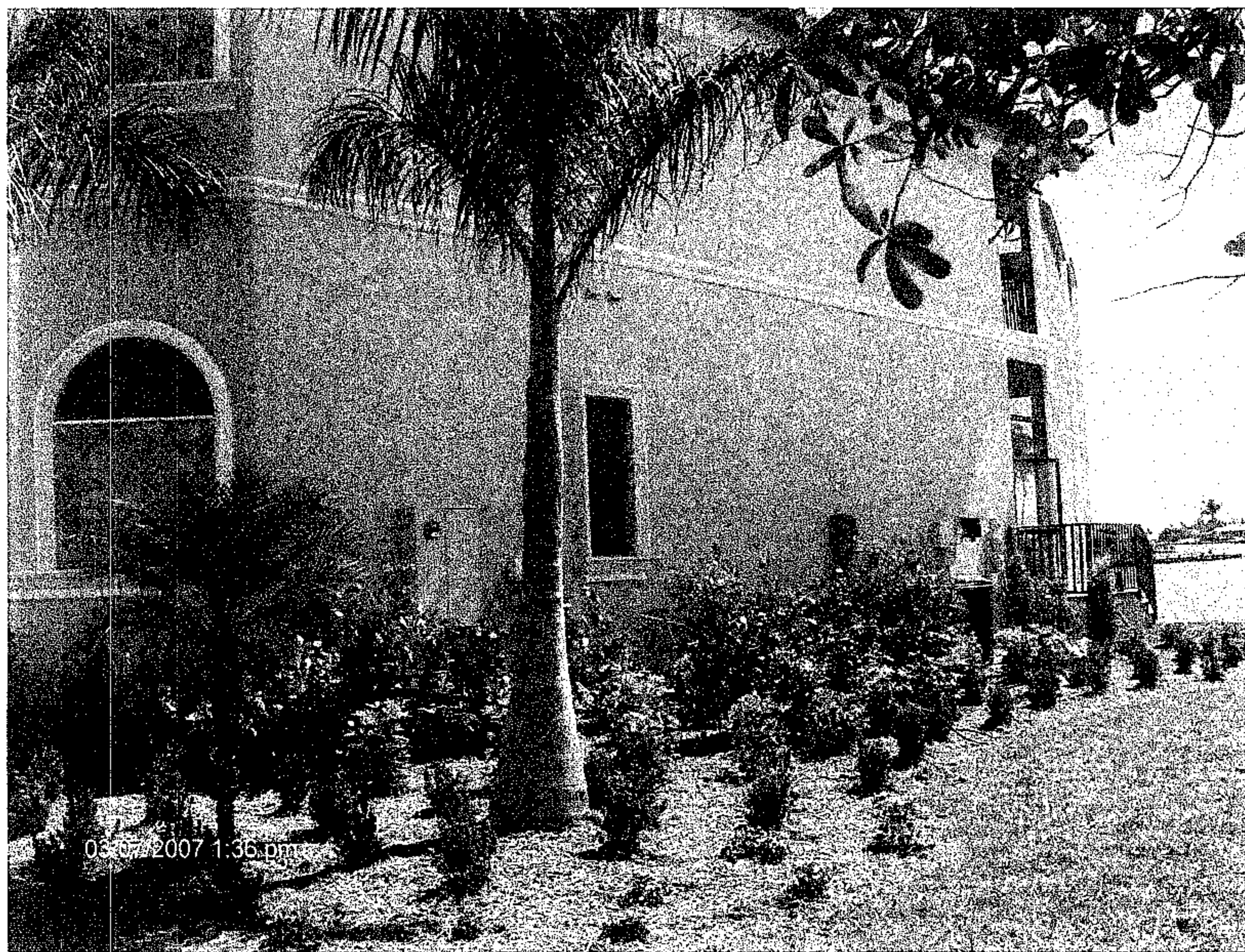
Right Side View 3/07/07