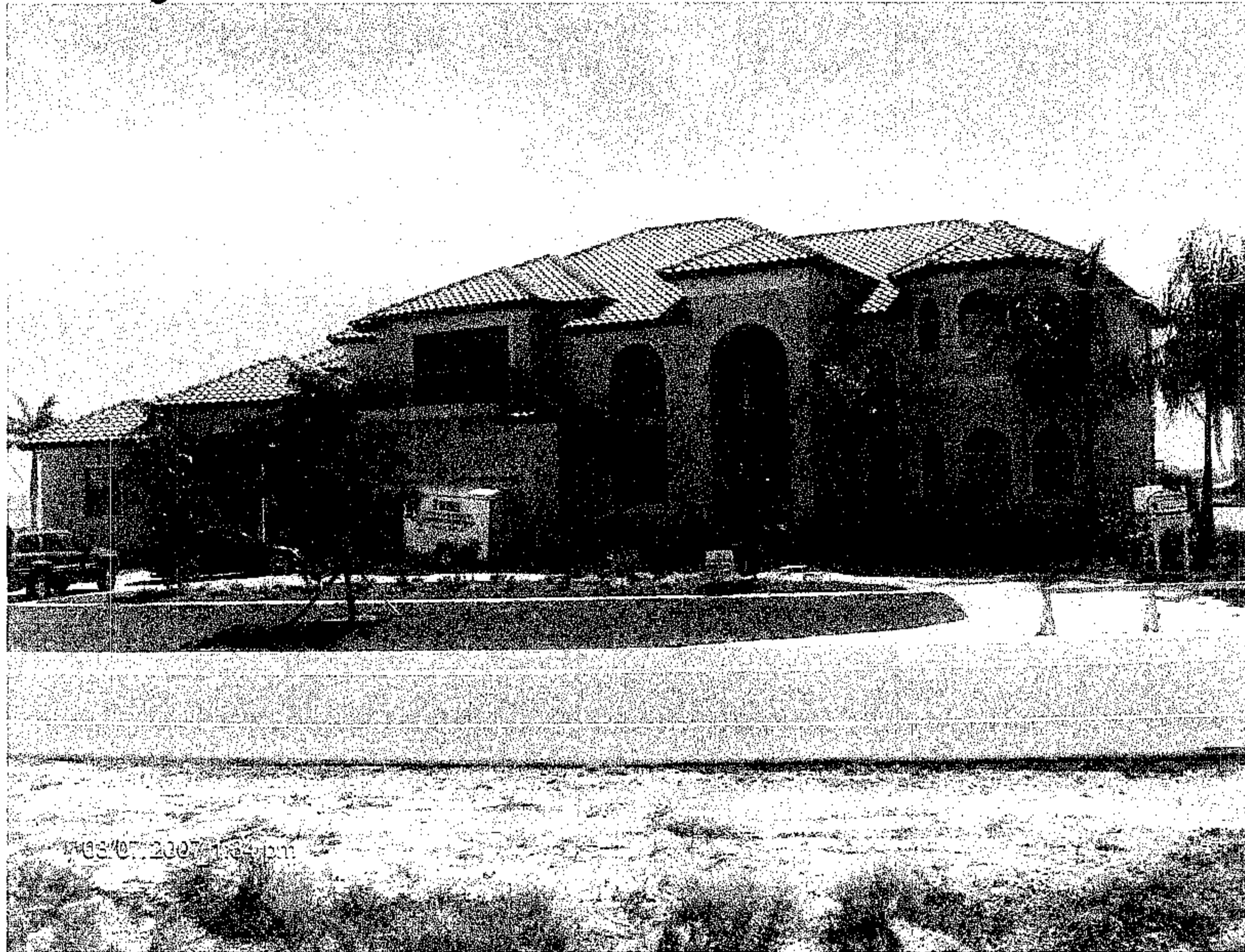
Front View 3/07/07

If using the Elevation Certificate to obtain NFIP flood insurance, affix at least two building photographs below according to the instructions for Item A6. Identify all photographs with: date taken; "Front View" and "Rear View"; and, if required, "Right Side View" and "Left Side View." If submitting more photographs than will fit on this page, use the Continuation Page, following.