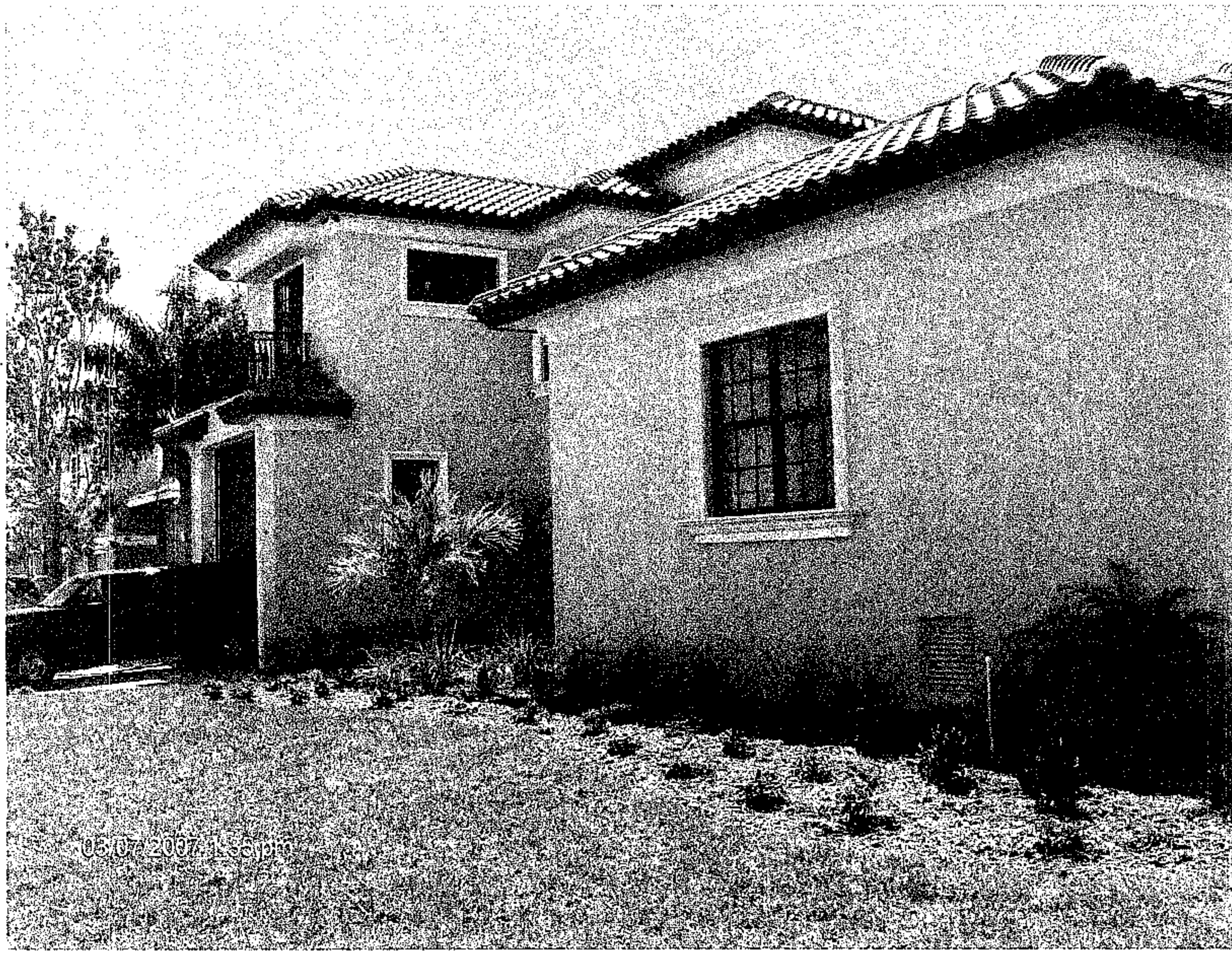
Left Side View 3/07/07

If using the Elevation Certificate to obtain NFIP flood insurance, affix at least two building photographs below according to the instructions for Item A6. Identify all photographs with: date taken; "Front View" and "Rear View"; and, if required, "Right Side View" and "Left Side View." If submitting more photographs than will fit on this page, use the Continuation Page, following.