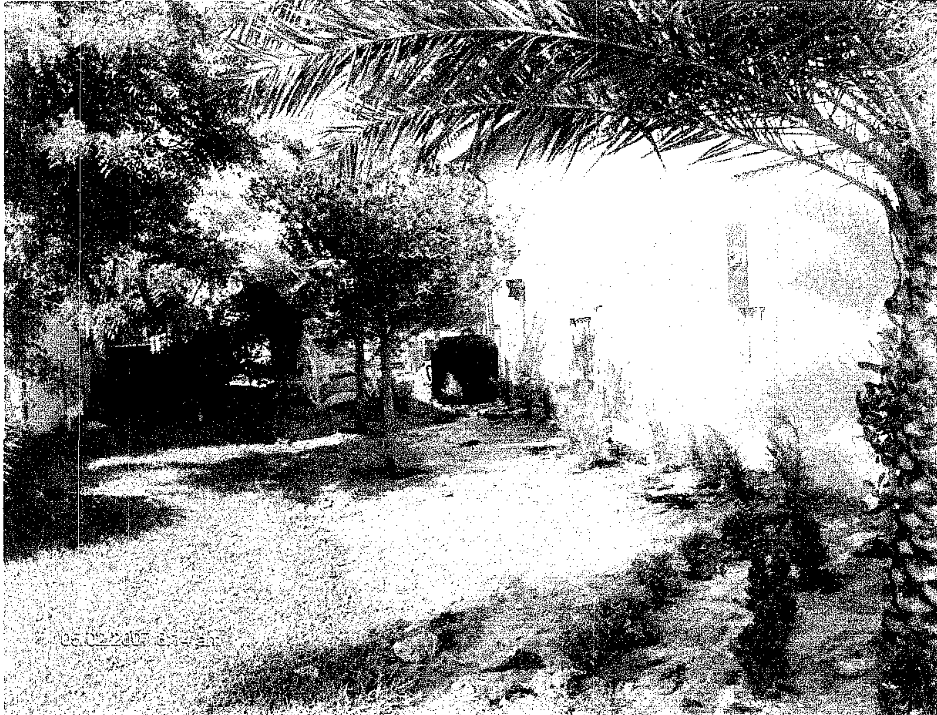
Left Side View 5/2/07

If using the Elevation Certificate to obtain NFIP flood insurance, affix at least two building photographs below according to the instructions for Item A6. Identify all photographs with: date taken; "Front View" and "Rear View"; and, if required, "Right Side View" and "Left Side View." If submitting more photographs than will fit on this page, use the Continuation Page, following.