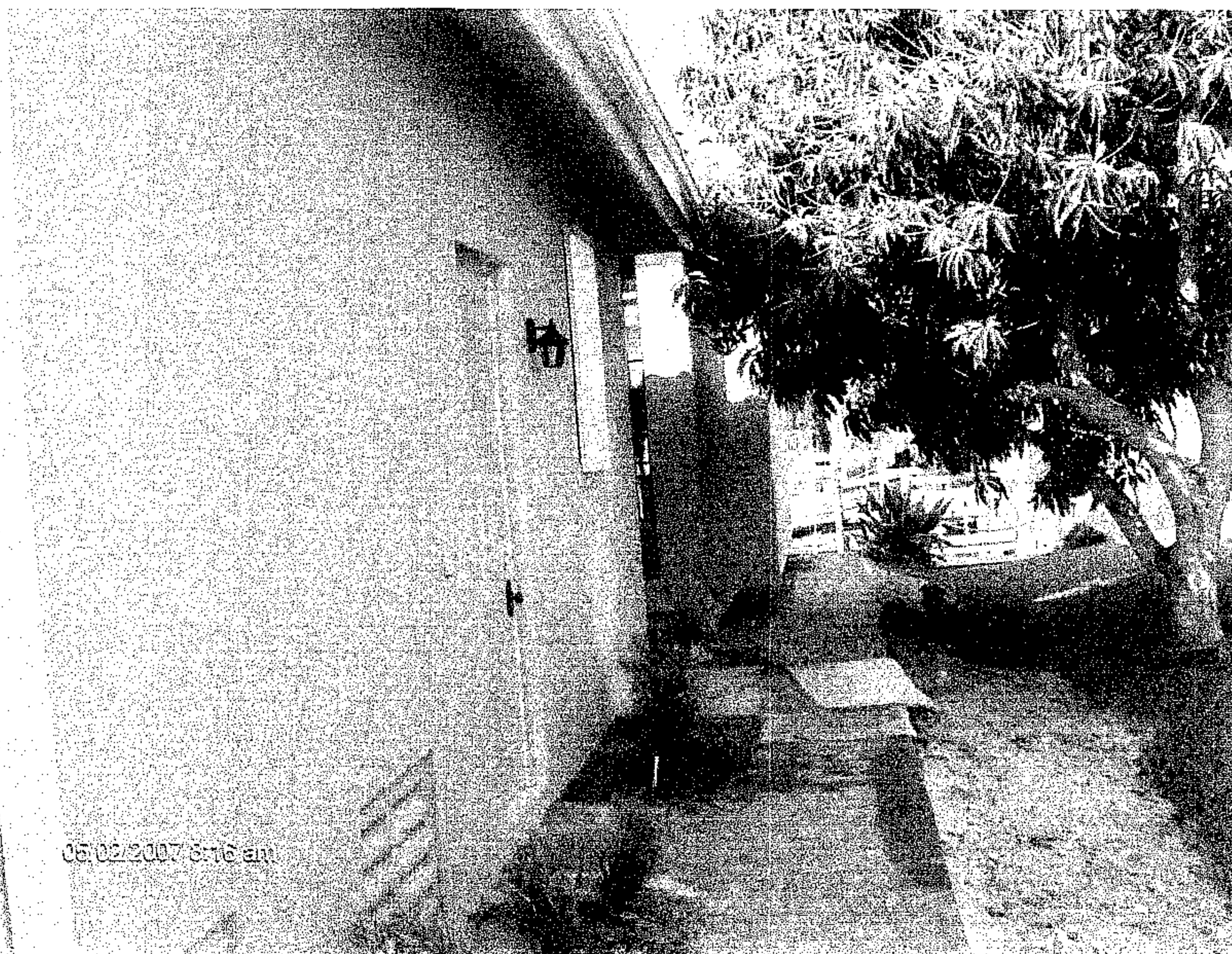
Right Side View 5/2/07