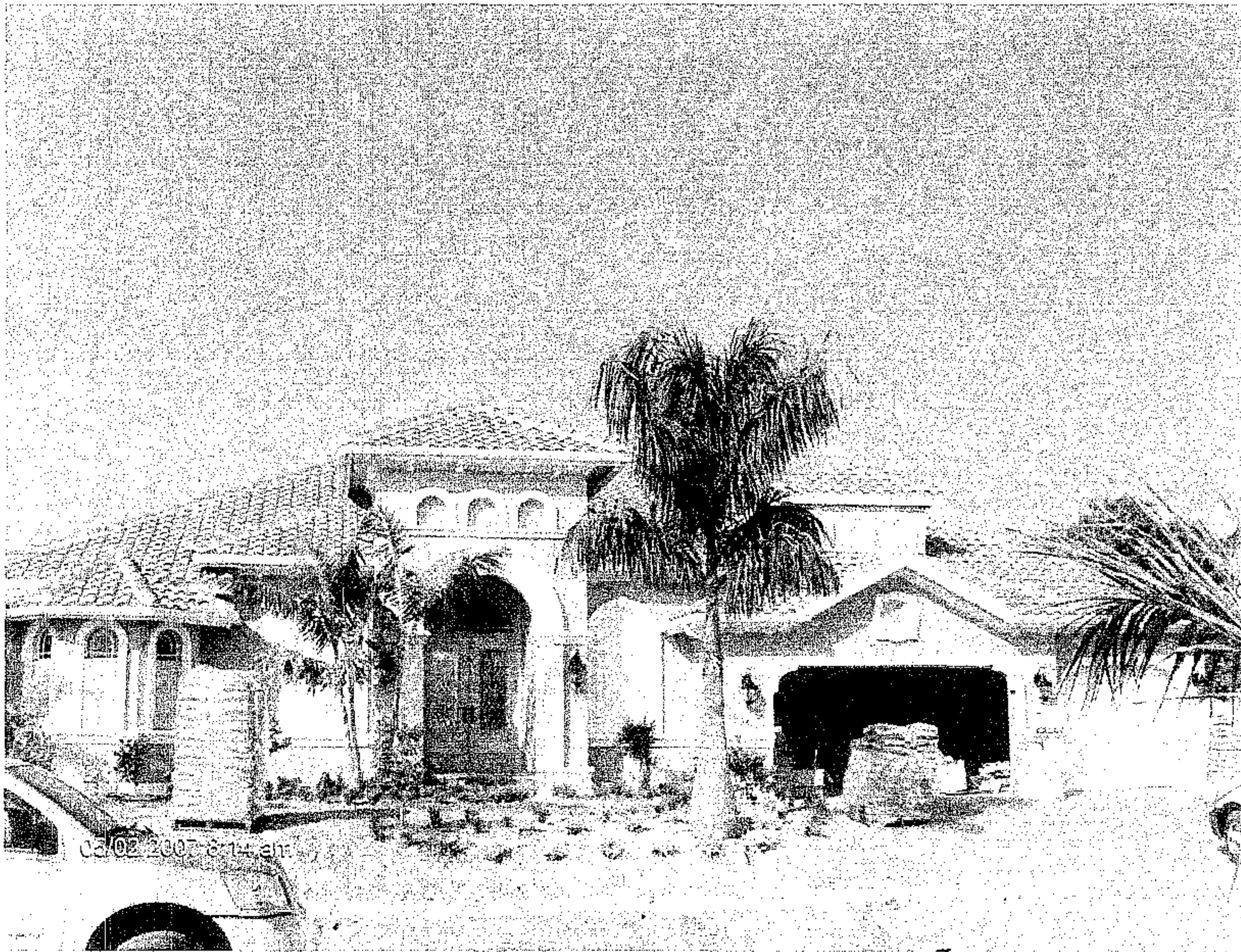
Front View 5/2/07

If using the Elevation Certificate to obtain NFIP flood insurance, affix at least two building photographs below according to the instructions for Item A6. Identify all photographs with: date taken; "Front View" and "Rear View"; and, if required, "Right Side View" and "Left Side View." If submitting more photographs than will fit on this page, use the Continuation Page, following.