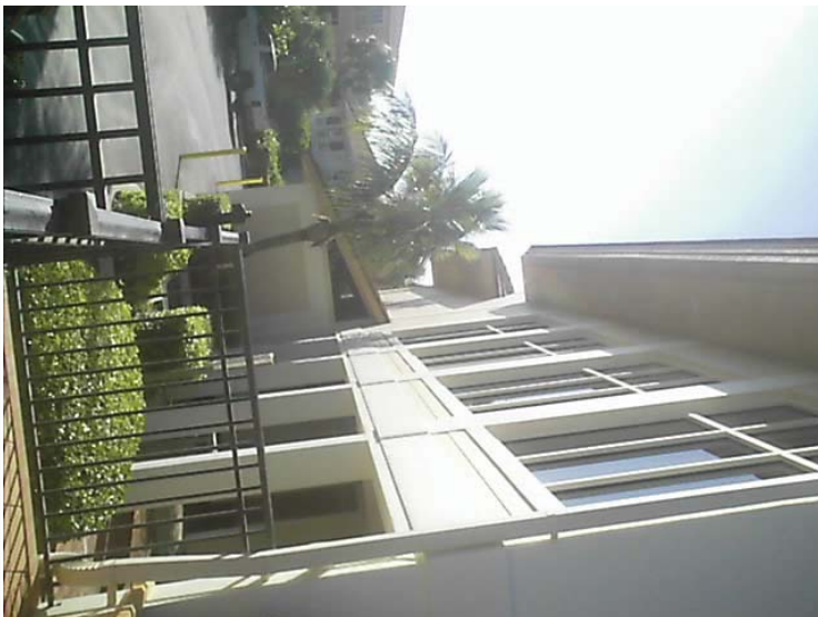
Right Property Picture