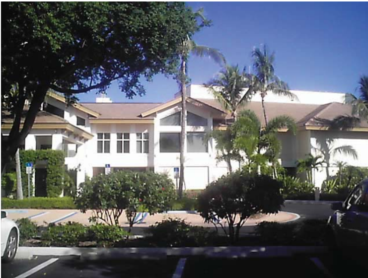
Front Property Picture 8/19/2010

If using the Elevation Certificate to obtain NFIP flood insurance, affix at least two building photographs below according to the instructions for Item A6. Identify all photographs with: date taken; "Front View" and "Rear View"; and, if required, "Right Side View" and "Left Side View." If submitting more photographs than will fit on this page, use the Continuation Page on the reverse.