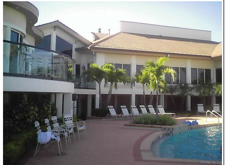
Rear Property Picture 8/19/2010