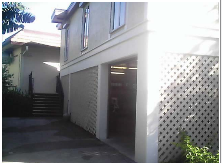
Left Property Picture