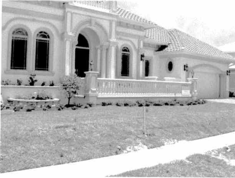
Front View 6/3/2009

If using the Elevation Certificate to obtain NFIP flood insurance, affix at least two building photographs below according to the instructions for Item A6. Identify all photographs with: date taken; "Front View" and "Rear View"; and, if required, "Right Side View" and "Left Side View." If submitting more photographs than will fit on this page, use the Continuation Page, following.