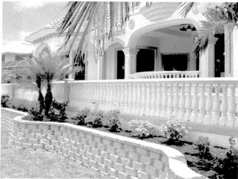
Rear View 6/3/2009