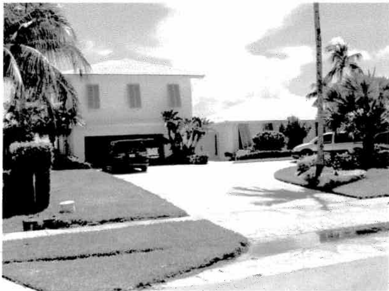
Front View 7/6/2009

If using the Elevation Certificate to obtain NFIP flood insurance, affix at least two building photographs below according to the instructions for Item A6. Identify all photographs with: date taken; "Front View" and "Rear View"; and, if required, "Right Side View" and "Left Side View." If submitting more photographs than will fit on this page, use the Continuation Page, following.