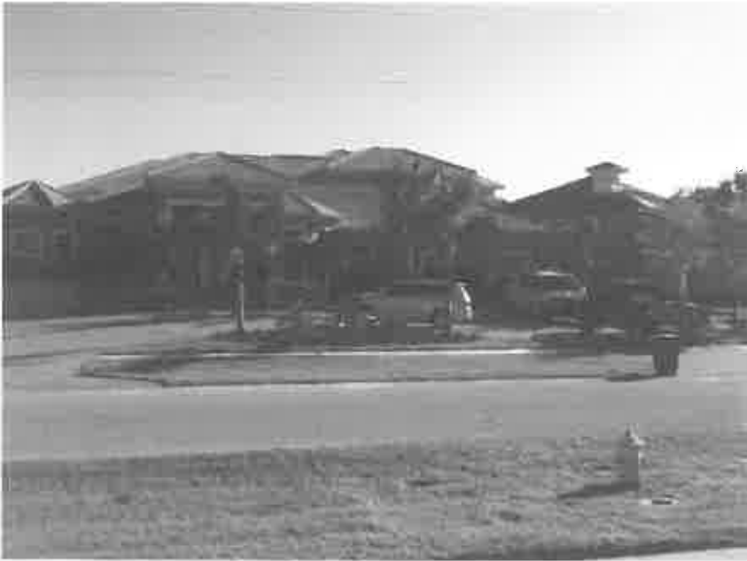
Front View 1/10/2013

If using the Elevation Certificate to obtain NFIP flood insurance, affix at least two building photographs below according to the instructions for Item A6. Identify all photographs with: date taken; "Front View" and "Rear View"; and, if required, "Right Side View" and "Left Side View." If submitting more photographs than will fit on this page, use the Continuation Page, following.