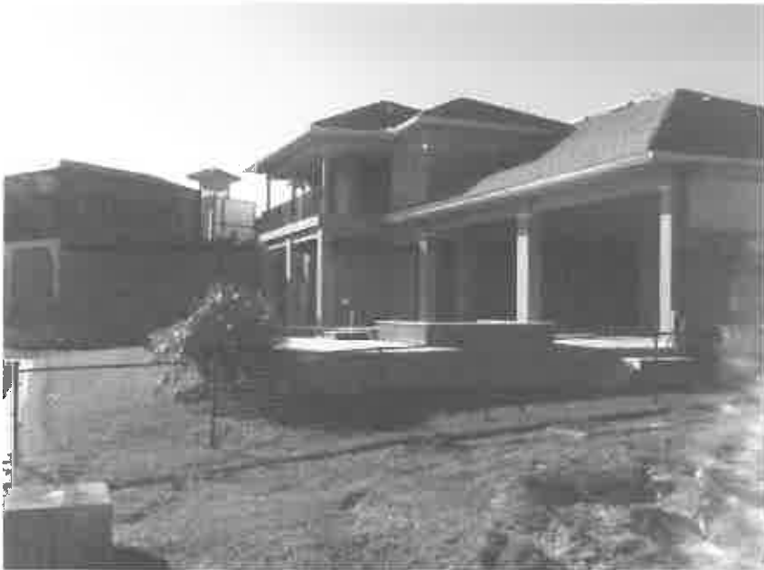
Rear View 1/10/2013