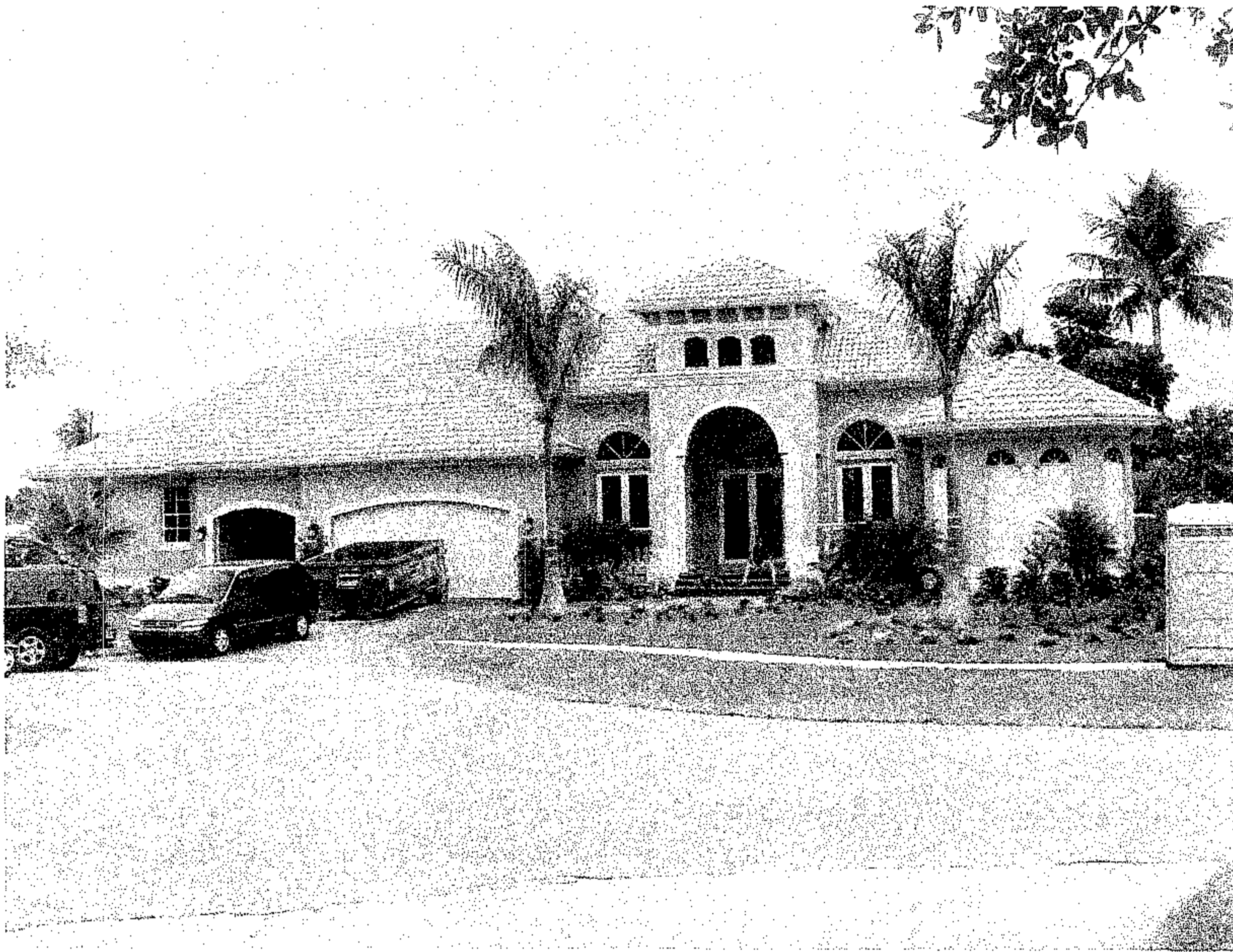
Front View 04/28/08

If using the Elevation Certificate to obtain NFIP flood insurance, affix at least two building photographs below according to the instructions for Item A6. Identify all photographs with: date taken; "Front View" and "Rear View"; and, if required, "Right Side View" and "Left Side View." If submitting more photographs than will fit on this page, use the Continuation Page, following.