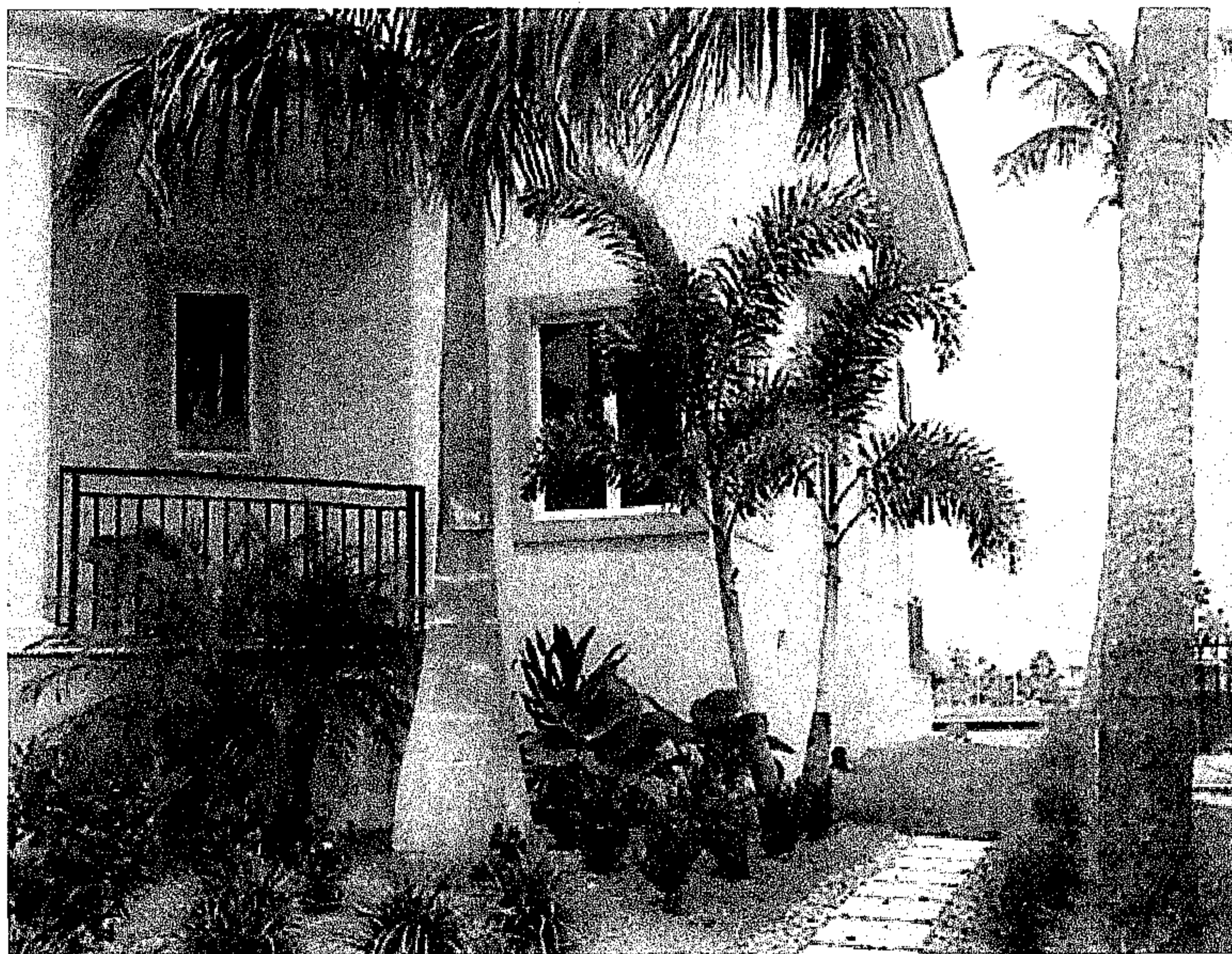
RIGHT SIDE VIEW DATE TAKEN: 04/24/07

If submitting more photographs than will fit on the preceding page, affix the additional photographs below. Identify all photographs with: date taken; "Front View" and "Rear View"; and, if required, "Right Side View" and "Left Side View."