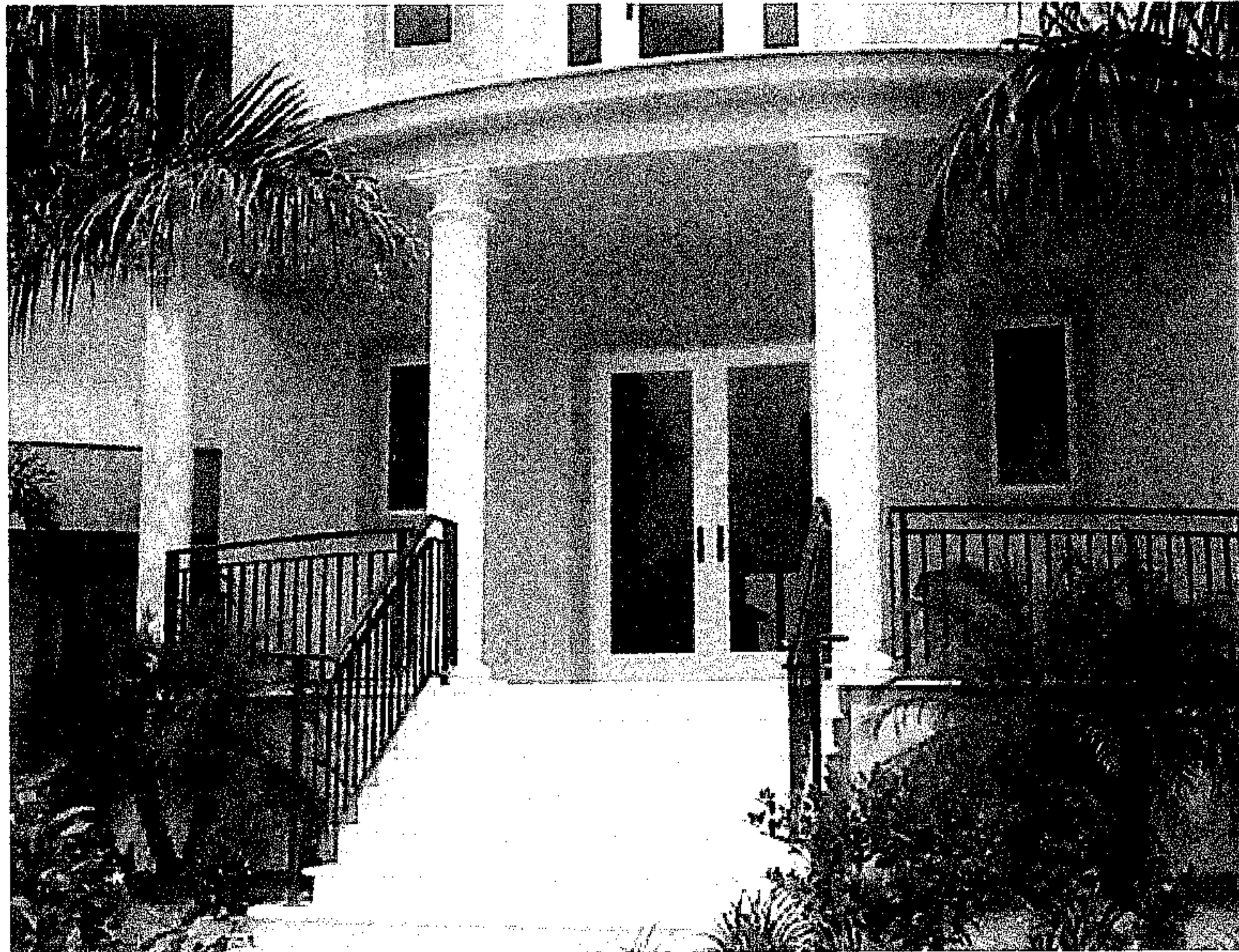
FRONT VIEW DATE TAKEN: 04/24/07

If using the Elevation Certificate to obtain NFIP flood insurance, affix at least two building photographs below according to the instructions for Item A6. Identify all photographs with: date taken; "Front View" and "Rear View"; and, if required, "Right Side View" and "Left Side View." If submitting more photographs than will fit on this page, use the Continuation Page, following.