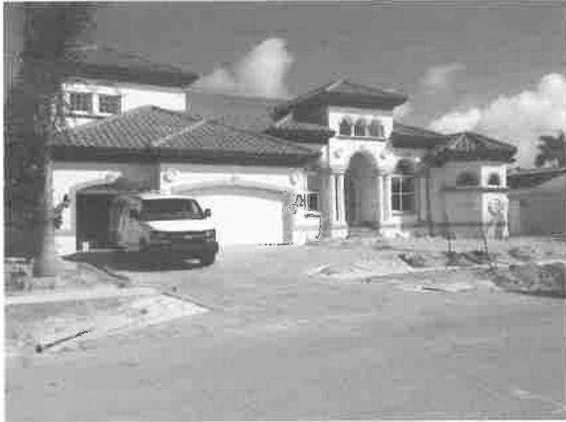
FRONT VIEW 4/12/2013

If using the Elevation Certificate to obtain NFIP flood insurance, affix at least 2 building photographs below according to the instructions for Item A6. Identify all photographs with date taken; "Front View" and "Rear View"; and, if required, "Right Side View" and "Left Side View." When applicable, photographs must show the foundation with representative examples of the flood openings or vents, as indicated in Section A8. If submitting more photographs than will fit on this page, use the Continuation Page.