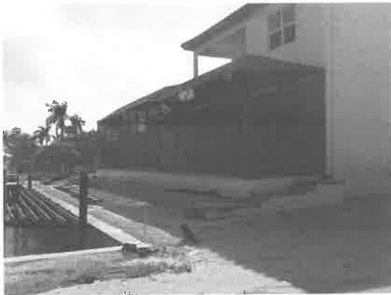
REAR VIEW 4/12/2013