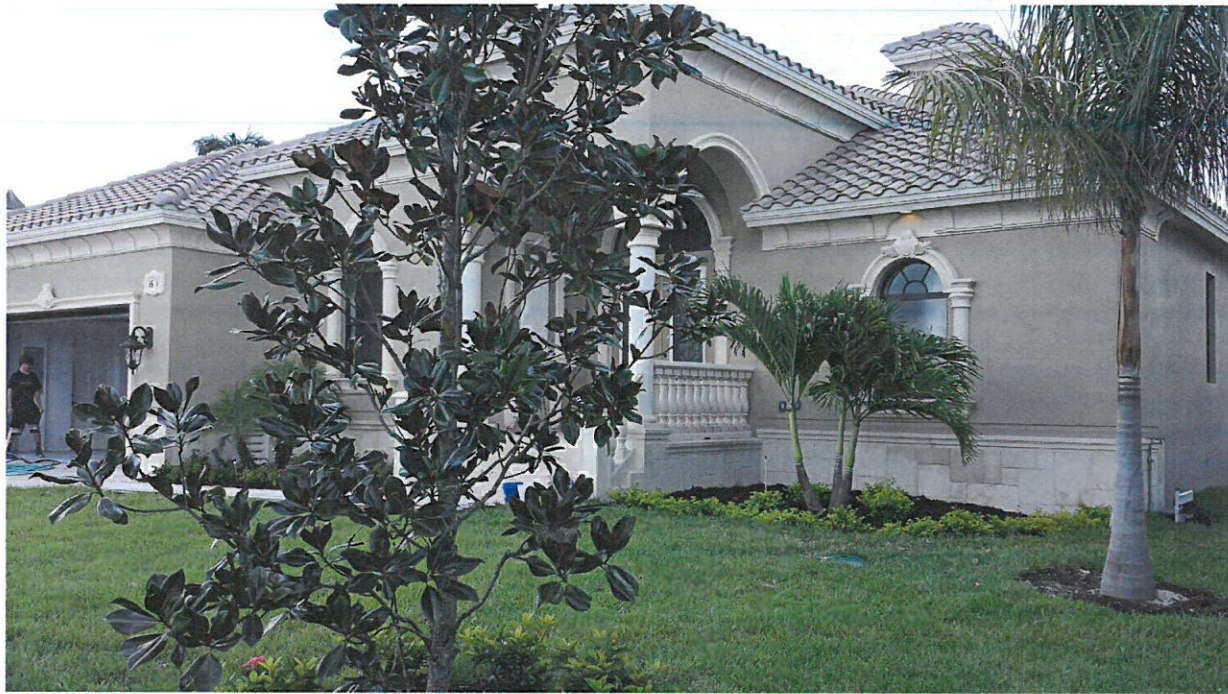
FRONT VIEW – 07/29/2013

If using the Elevation Certificate to obtain NFIP flood insurance, affix at least 2 building photographs below according to the instructions for Item A6. Identify all photographs with date taken; "Front View" and "Rear View"; and, if required, "Right Side View" and "Left Side View." When applicable, photographs must show the foundation with representative examples of the flood openings or vents, as indicated in Section A8. If submitting more photographs than will fit on this page, use the Continuation Page.