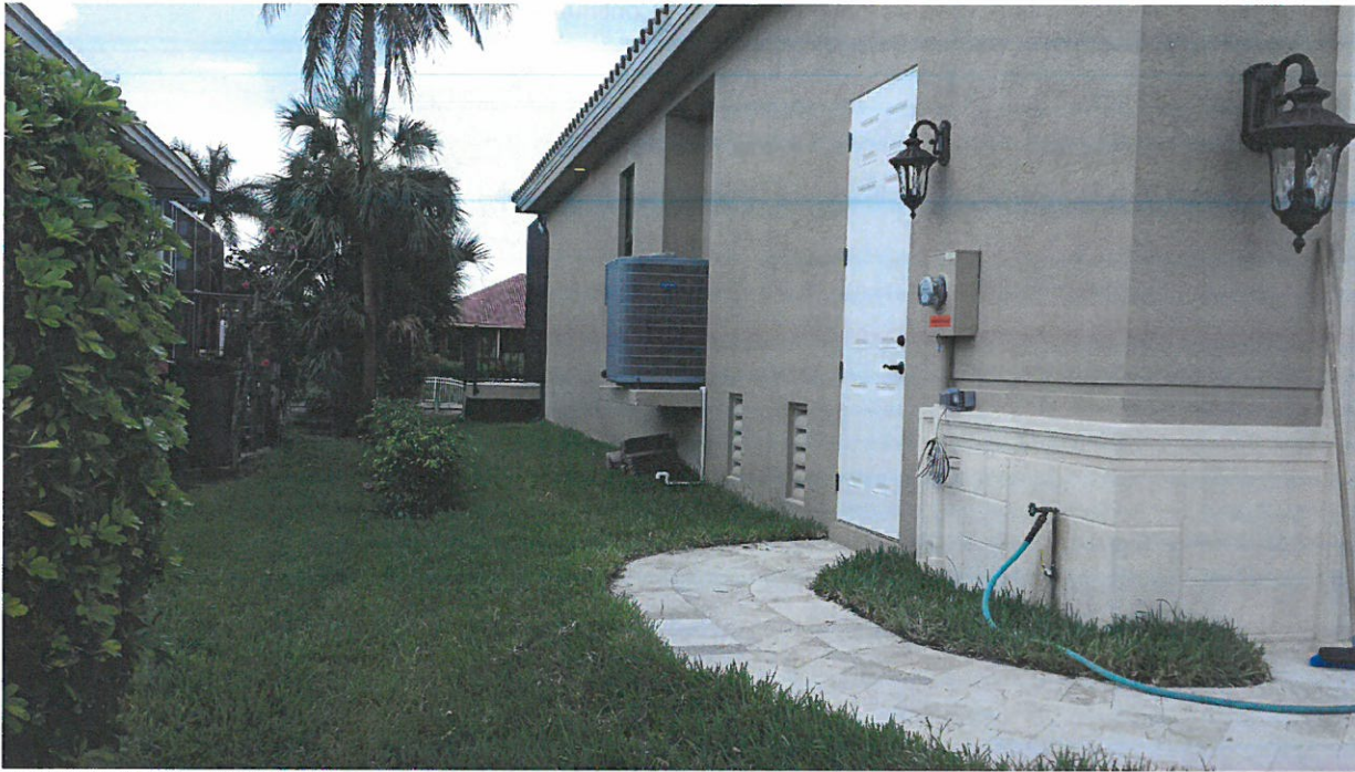
LEFT SIDE VIEW – 07/29/2013

If submitting more photographs than will fit on the preceding page, affix the additional photographs below. Identify all photographs with: date taken; "Front View" and "Rear View"; and, if required, "Right Side View" and "Left Side View." When applicable, photographs must show the foundation with representative examples of the flood openings or vents, as indicated in Section A8.