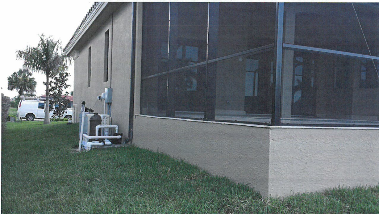
RIGHT SIDE VIEW – 07/29/2013