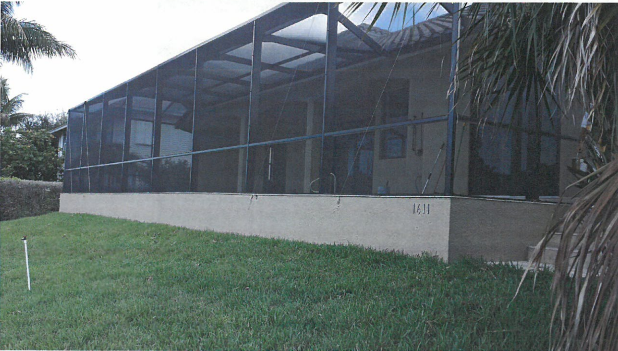
REAR VIEW – 07/29/2013