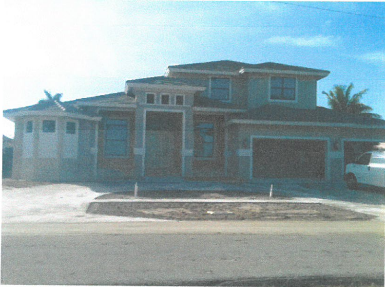
FRONT VIEW 1/26/16

If using the Elevation Certificate to obtain NFIP flood insurance, affix at least 2 building photographs below according to the instructions for Item A6. Identify all photographs with date taken; "Front View" and "Rear View"; and, if required, "Right Side View" and "Left Side View." When applicable, photographs must show the foundation with representative examples of the flood openings or vents, as indicated in Section A8. If submitting more photographs than will fit on this page, use the Continuation Page.