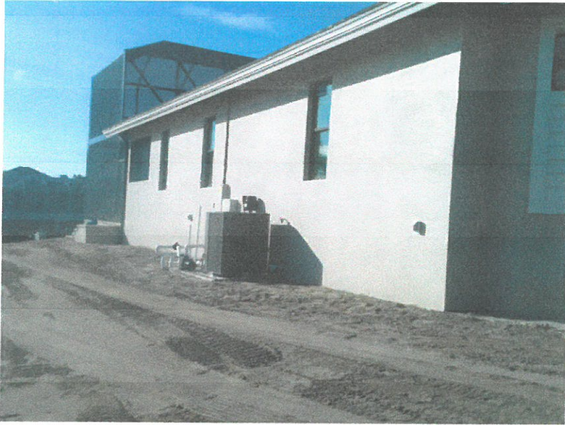
LEFT SIDE VIEW 1/26/16

If submitting more photographs than will fit on the preceding page, affix the additional photographs below. Identify all photographs with: date taken; "Front View" and "Rear View"; and, if required, "Right Side View" and "Left Side View." When applicable, photographs must show the foundation with representative examples of the flood openings or vents, as indicated in Section A8.