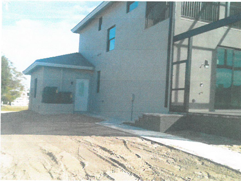
RIGHT SIDE VIEW 1/26/16