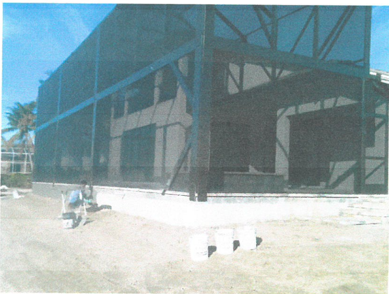
REAR VIEW 1/26/16