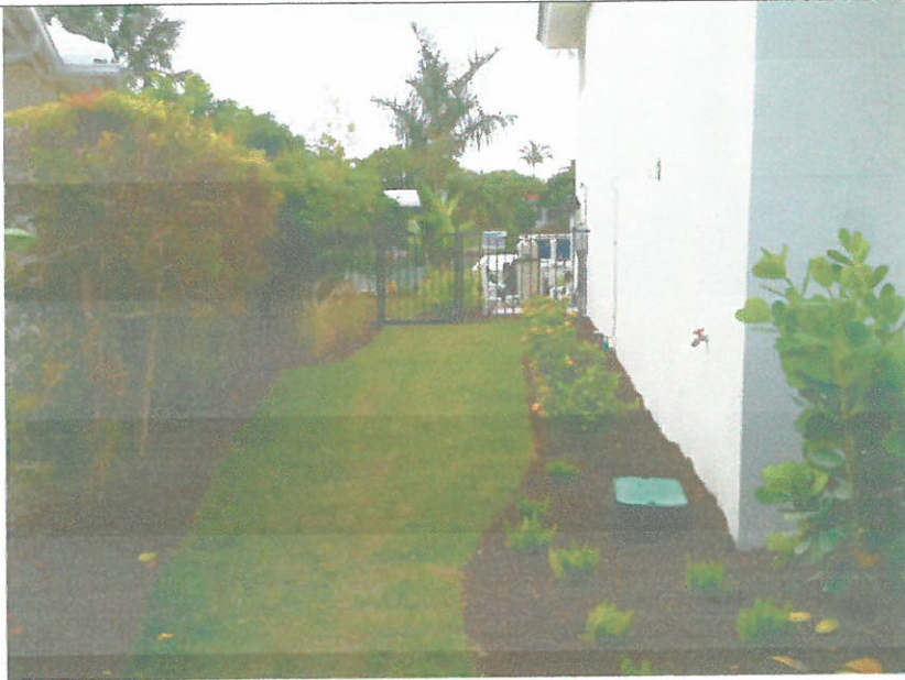
LEFT SIDE VIEW 11/5/14

If submitting more photographs than will fit on the preceding page, affix the additional photographs below. Identify all photographs with: date taken; "Front View" and "Rear View"; and, if required, "Right Side View" and "Left Side View." When applicable, photographs must show the foundation with representative examples of the flood openings or vents, as indicated in Section A8.