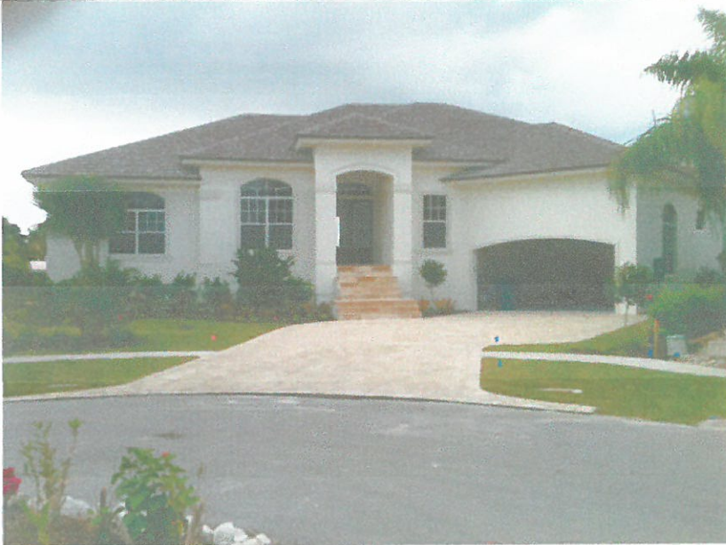
FRONT VIEW 11/5/14

If using the Elevation Certificate to obtain NFIP flood insurance, affix at least 2 building photographs below according to the instructions for Item A6. Identify all photographs with date taken, "Front View" and "Rear View"; and, if required, "Right Side View" and "Left Side View." When applicable, photographs must show the foundation with representative examples of the flood openings or vents, as indicated in Section A8. If submitting more photographs than will fit on this page, use the Continuation Page.