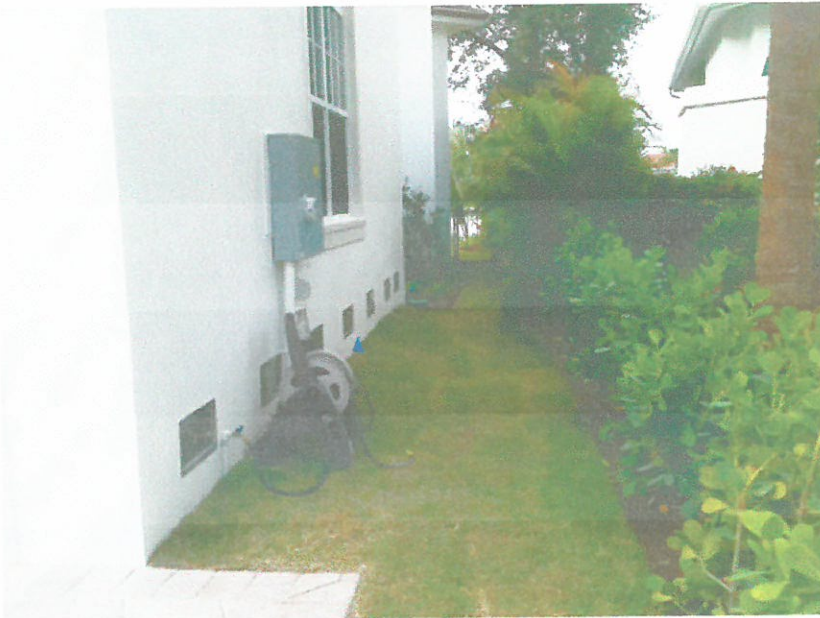
RIGHT SIDE VIEW 11/5/14