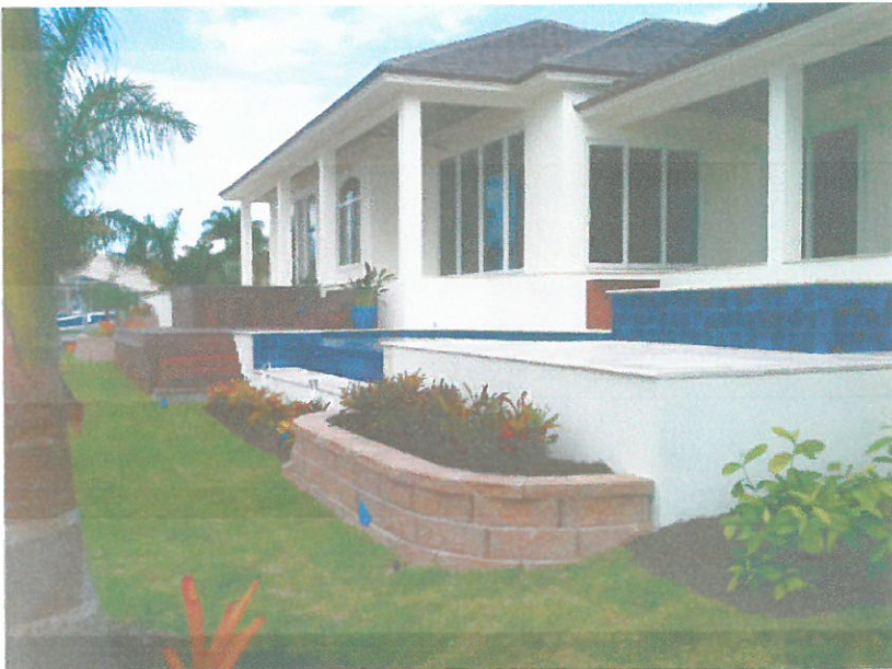
REAR VIEW 11/5/14