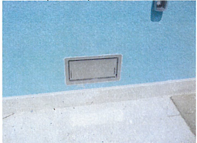
Vent View (East Side)