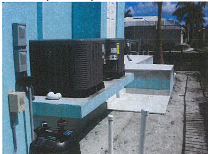
A/C View (East Side)