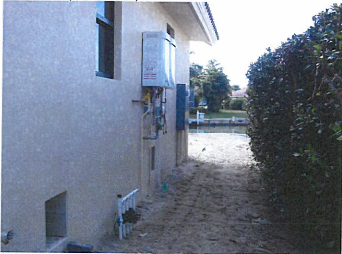
Vent View (North Side)