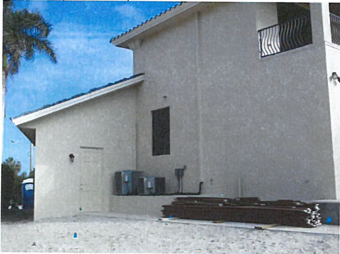
A/C View (South Side)