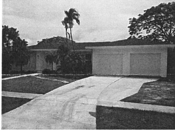
FRONT VIEW 6/10/16

If using the Elevation Certificate to obtain NFIP flood insurance, affix at least 2 building photographs below according to the instructions for Item A6. Identify all photographs with date taken; "Front view" and "Rear view"; and, if required, "Right Side View" and "Left Side View." When applicable, photographs must show the foundation with representative examples of the flood openings or vents, as indicated in Section A8. If submitting more photographs than will fit on this page, use the Continuation Page.