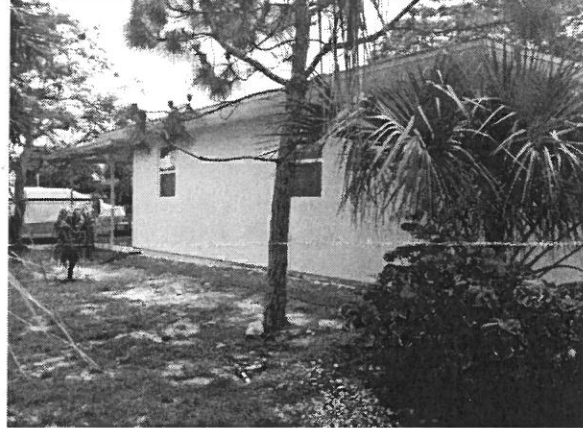
LEFT SIDE VIEW 6/10/16