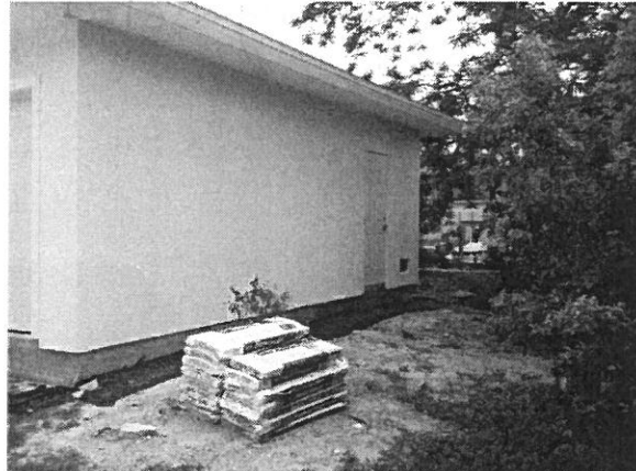
RIGHT SIDE VIEW 6/10/16