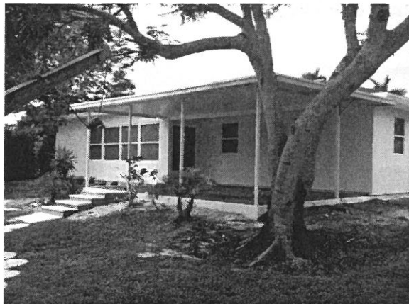
REAR VIEW 6/10/16