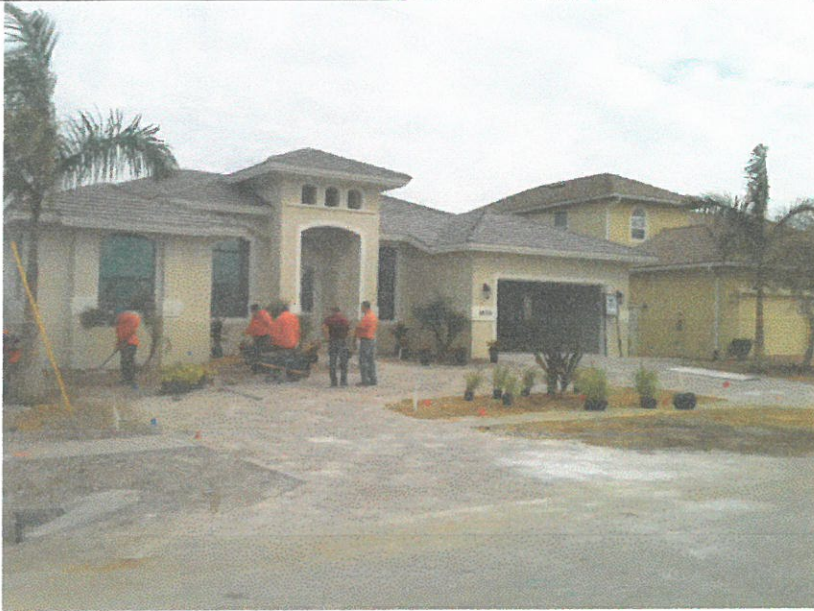
FRONT VIEW 2/15/16

If using the Elevation Certificate to obtain NFIP flood insurance, affix at least 2 building photographs below according to the instructions for Item A6. Identify all photographs with date taken; "Front View" and "Rear View"; and, if required, "Right Side View" and "Left Side View." When applicable, photographs must show the foundation with representative examples of the flood openings or vents, as indicated in Section A8. If submitting more photographs than will fit on this page, use the Continuation Page.