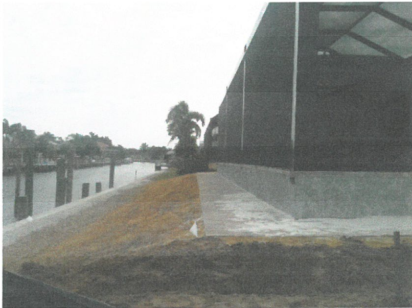
REAR VIEW 2/15/16