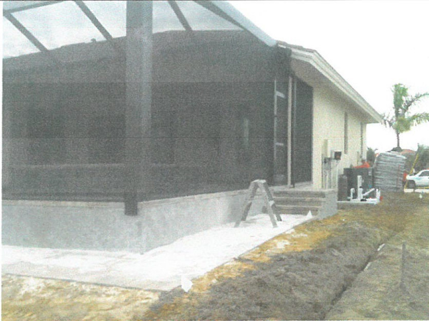
LEFT SIDE VIEW 2/15/16

If submitting more photographs than will fit on the preceding page, affix the additional photographs below. Identify all photographs with: date taken; "Front View" and "Rear View"; and, if required, "Right Side View" and "Left Side View." When applicable, photographs must show the foundation with representative examples of the flood openings or vents, as indicated in Section A8.