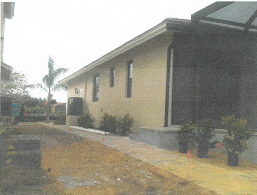
RIGHT SIDE VIEW 2/15/16