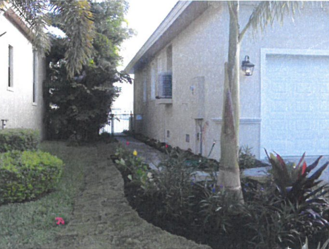
Side & A/C View