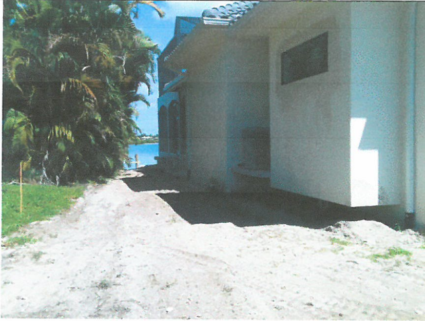
LEFT SIDE VIEW 6/24/15

If submitting more photographs than will fit on the preceding page, affix the additional photographs below. Identify all photographs with: date taken; "Front View" and "Rear View"; and, if required, "Right Side View" and "Left Side View." When applicable, photographs must show the foundation with representative examples of the flood openings or vents, as indicated in Section A8.