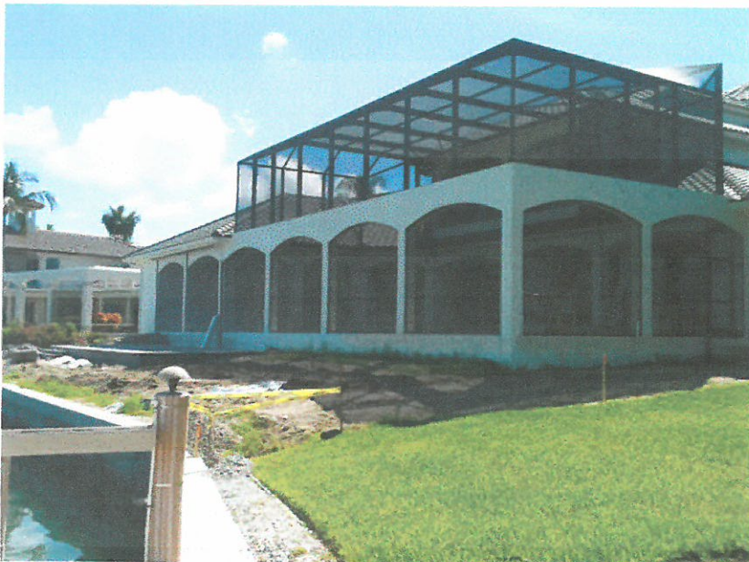
REAR VIEW 6/24/15