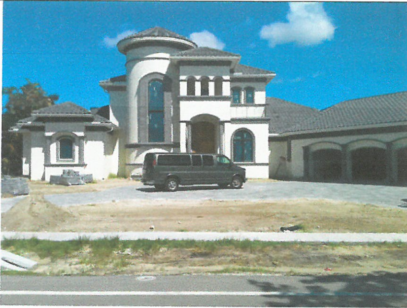
FRONT VIEW 6/24/15

If using the Elevation Certificate to obtain NFIP flood insurance, affix at least 2 building photographs below according to the instructions for Item A6. Identify all photographs with date taken; "Front View" and "Rear View"; and, if required, "Right Side View" and "Left Side View." When applicable, photographs must show the foundation with representative examples of the flood openings or vents, as indicated in Section A8. If submitting more photographs than will fit on this page, use the Continuation Page.