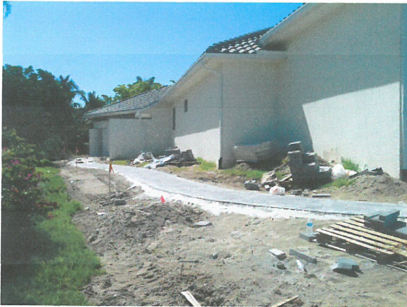
RIGHT SIDE VIEW 6/24/15