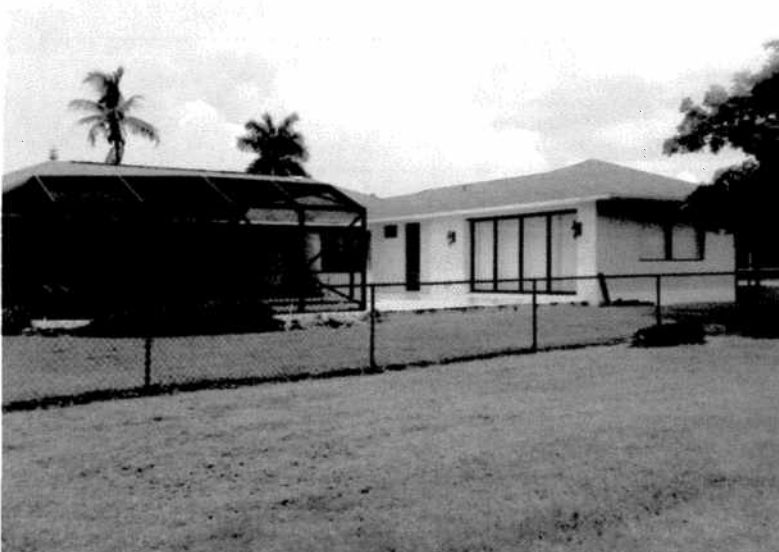
Rear View 8/24/2011