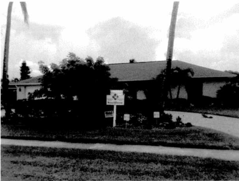
Front View 8/24/2011

If using the Elevation Certificate to obtain NFIP flood insurance, affix at least two building photographs below according to the instructions for Item A6. Identify all photographs with: date taken; "Front View" and "Rear View"; and, if required, "Right Side View" and "Left Side View." If submitting more photographs than will fit on this page, use the Continuation Page, following.