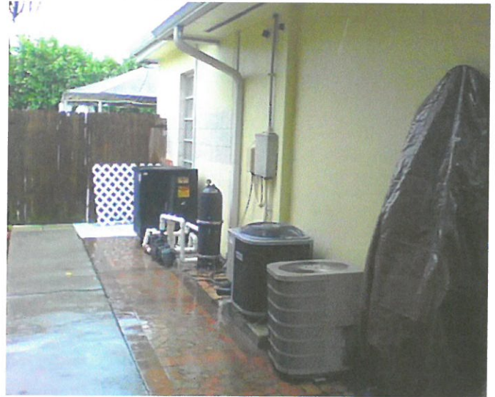
Left Side View 01/27/16