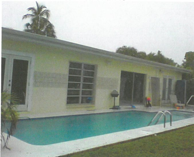
Rear View 01/27/16