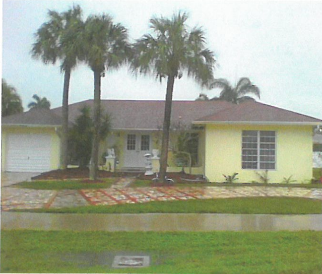
Front View 01/27/16