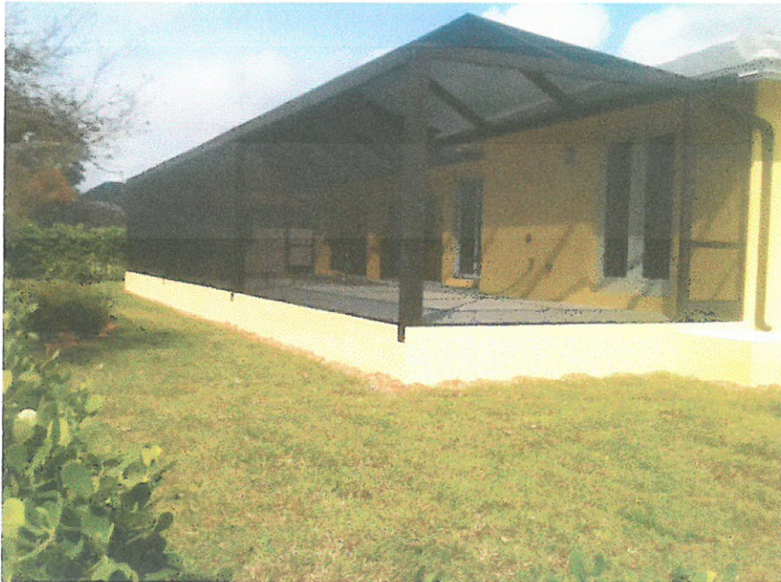
REAR VIEW 2/26/2014