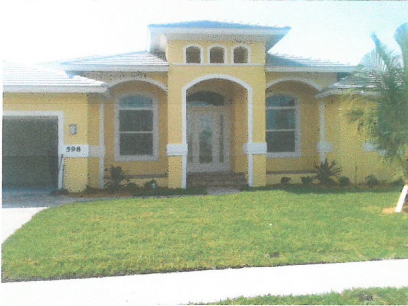
FRONT VIEW 2/26/2014

If using the Elevation Certificate to obtain NFIP flood insurance, affix at least 2 building photographs below according to the instructions for Item A6. Identify all photographs with date taken; "Front View" and "Rear View"; and, if required, "Right Side View" and "Left Side View." When applicable, photographs must show the foundation with representative examples of the flood openings or vents, as indicated in Section A8. If submitting more photographs than will fit on this page, use the Continuation Page.