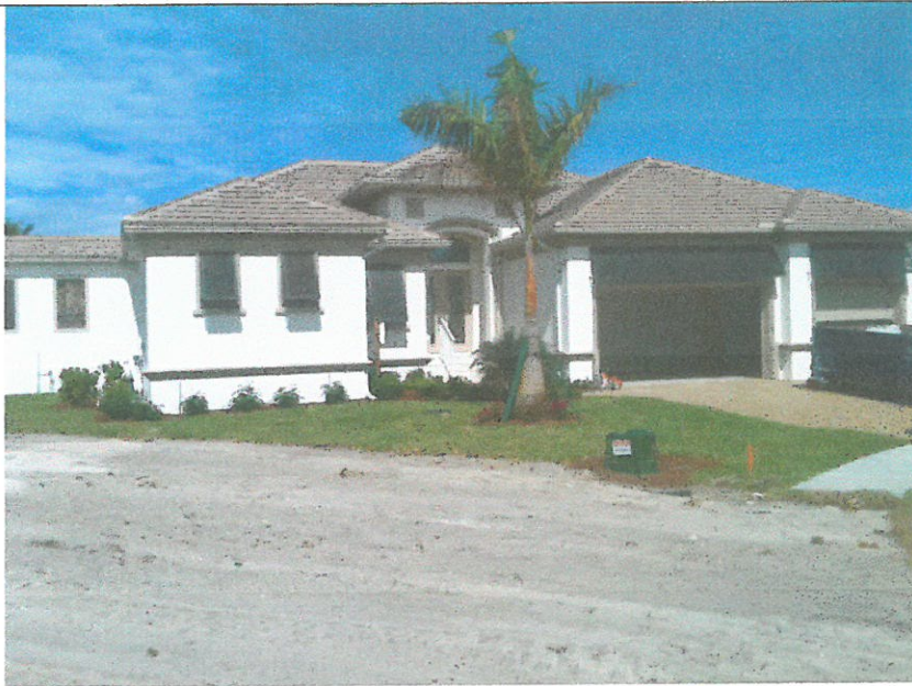
FRONT VIEW 2/9/15

If using the Elevation Certificate to obtain NFIP flood insurance, affix at least 2 building photographs below according to the instructions for Item A6. Identify all photographs with date taken; "Front View" and "Rear View"; and, if required, "Right Side View" and "Left Side View." When applicable, photographs must show the foundation with representative examples of the flood openings or vents, as indicated in Section A8. If submitting more photographs than will fit on this page, use the Continuation Page.