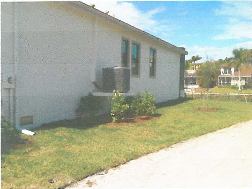
RIGHT SIDE VIEW 2/9/15