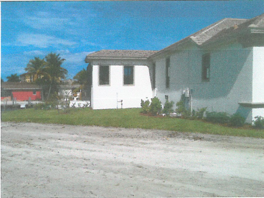
LEFT SIDE VIEW 2/9/15

If submitting more photographs than will fit on the preceding page, affix the additional photographs below. Identify all photographs with: date taken; "Front View" and "Rear View"; and, if required, "Right Side View" and "Left Side View." When applicable, photographs must show the foundation with representative examples of the flood openings or vents, as indicated in Section A8.