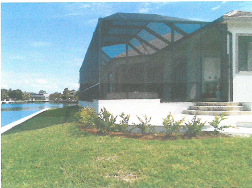
REAR VIEW 2/9/15