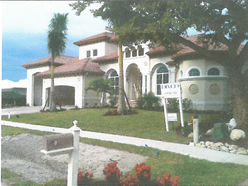
FRONT VIEW 2/9/15

If using the Elevation Certificate to obtain NFIP flood insurance, affix at least 2 building photographs below according to the instructions for Item A6. Identify all photographs with date taken; "Front View" and "Rear View"; and, if required, "Right Side View" and "Left Side View." When applicable, photographs must show the foundation with representative examples of the flood openings or vents, as indicated in Section A8. If submitting more photographs than will fit on this page, use the Continuation Page.