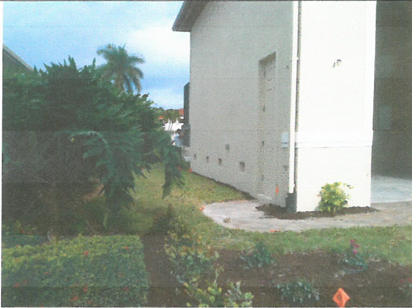
LEFT SIDE VIEW 2/9/15

If submitting more photographs than will fit on the preceding page, affix the additional photographs below. Identify all photographs with: date taken; "Front View" and "Rear View"; and, if required, "Right Side View" and "Left Side View." When applicable, photographs must show the foundation with representative examples of the flood openings or vents, as indicated in Section A8.