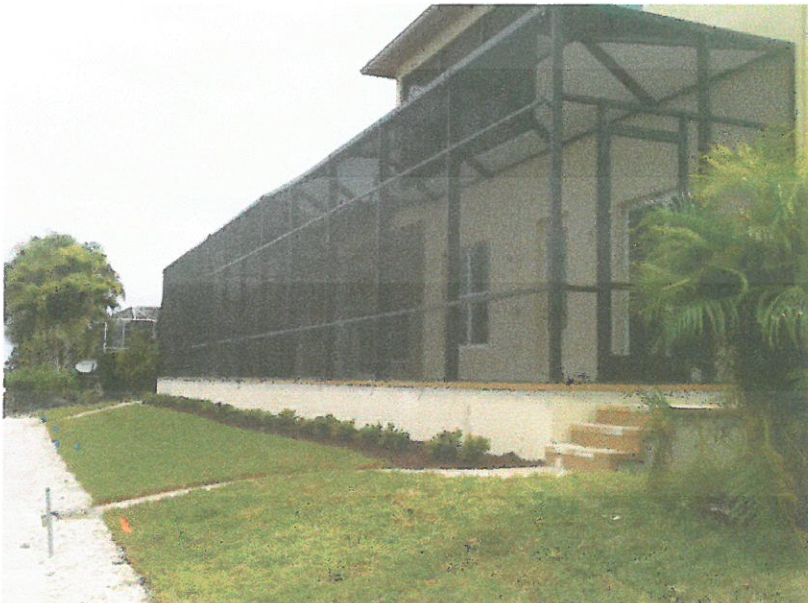
REAR VIEW 2/9/15