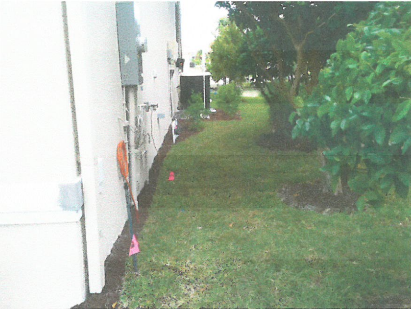
RIGHT SIDE VIEW 2/9/15