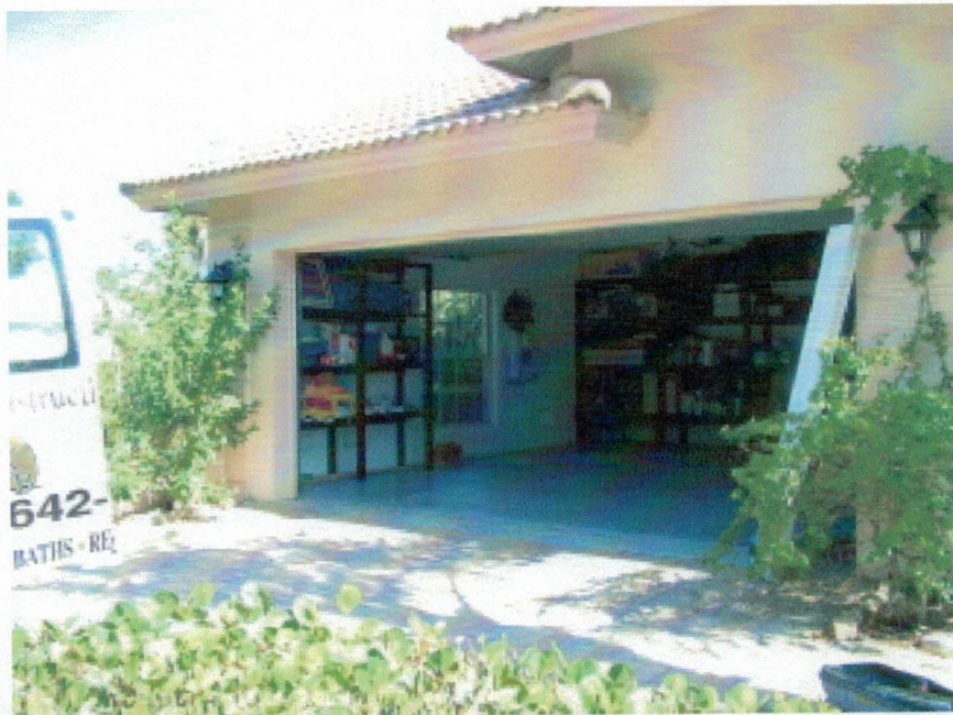
RIGHT SIDE VIEW (GARAGE FLOOD VENTS) April 7, 2010