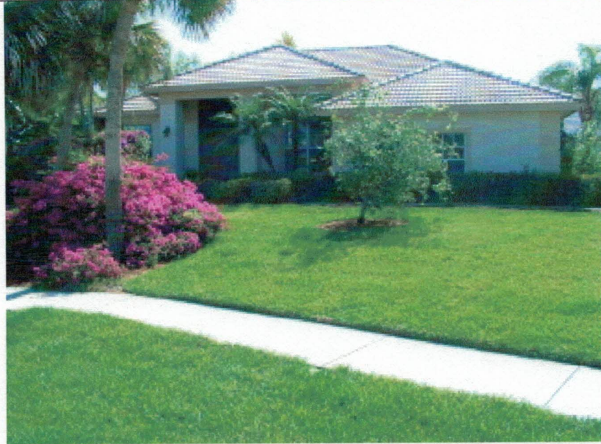
FRONT VIEW (WEST) April 7, 2010

If using the Elevation Certificate to obtain NFIP flood insurance, affix at least two building photographs below according to the instructions for Item A6. Identify all photographs with: date taken; "Front View" and "Rear View"; and, if required, "Right Side View" and "Left Side View." If submitting more photographs than will fit on this page, use the Continuation Page, following.