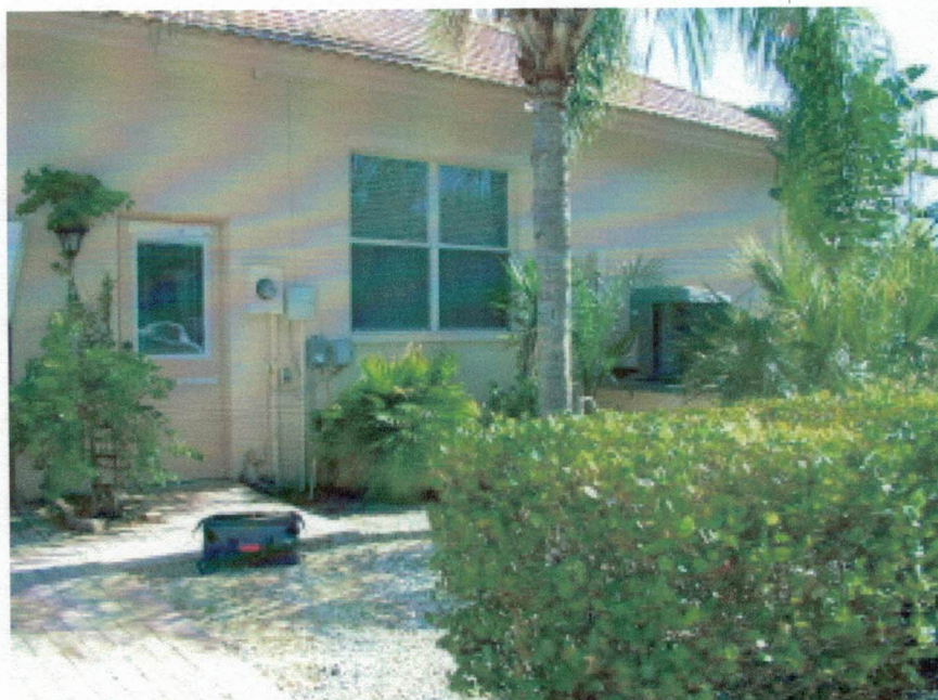
RIGHT SIDE VIEW ( EAST) April 7, 2010