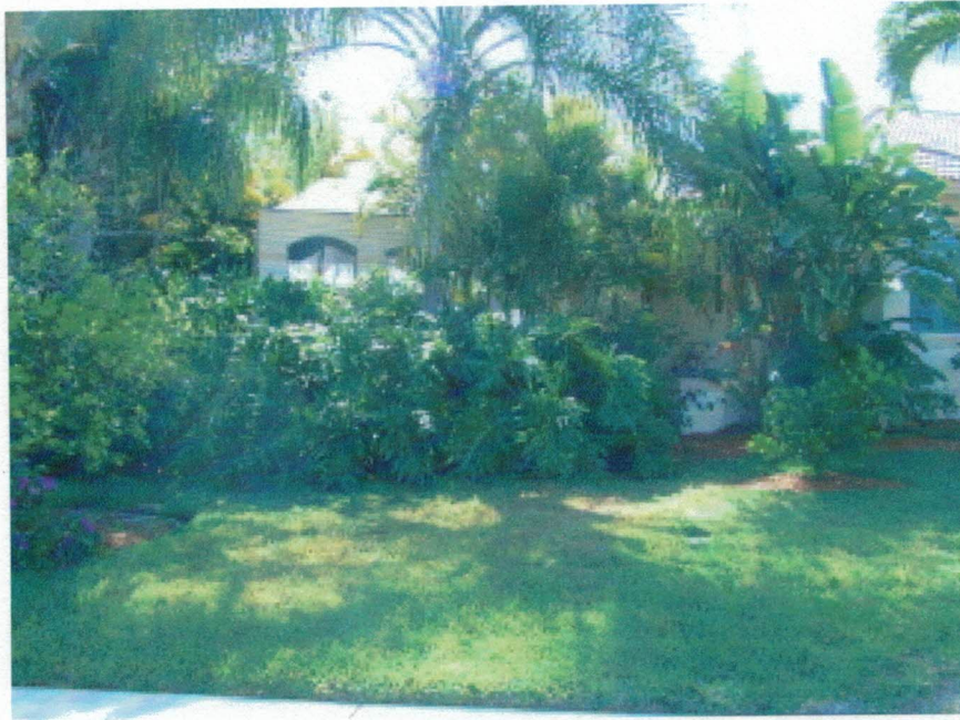
LEFT SIDE VIEW (NORTH) April 7, 2010