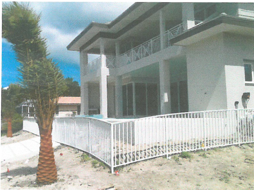
REAR VIEW 6/4/15