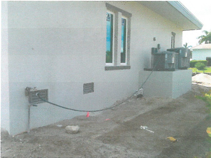
RIGHT SIDE VIEW 6/4/15