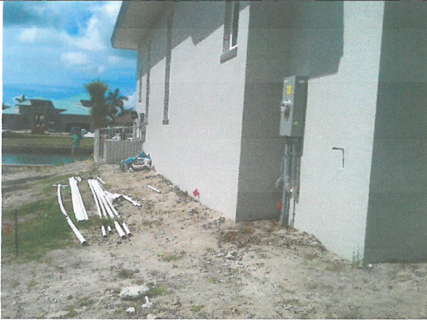
LEFT SIDE VIEW 6/4/15

If submitting more photographs than will fit on the preceding page, affix the additional photographs below. Identify all photographs with: date taken; "Front View" and "Rear View"; and, if required, "Right Side View" and "Left Side View." When applicable, photographs must show the foundation with representative examples of the flood openings or vents, as indicated in Section A8.