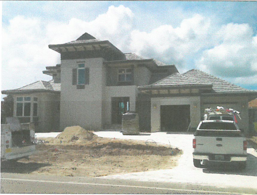
FRONT VIEW 6/4/15

If using the Elevation Certificate to obtain NFIP flood insurance, affix at least 2 building photographs below according to the instructions for Item A6. Identify all photographs with date taken; "Front View" and "Rear View"; and, if required, "Right Side View" and "Left Side View." When applicable, photographs must show the foundation with representative examples of the flood openings or vents, as indicated in Section A8. If submitting more photographs than will fit on this page, use the Continuation Page.