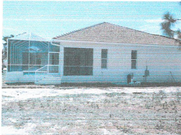
LEFT SIDE 06-28-16 Image Field