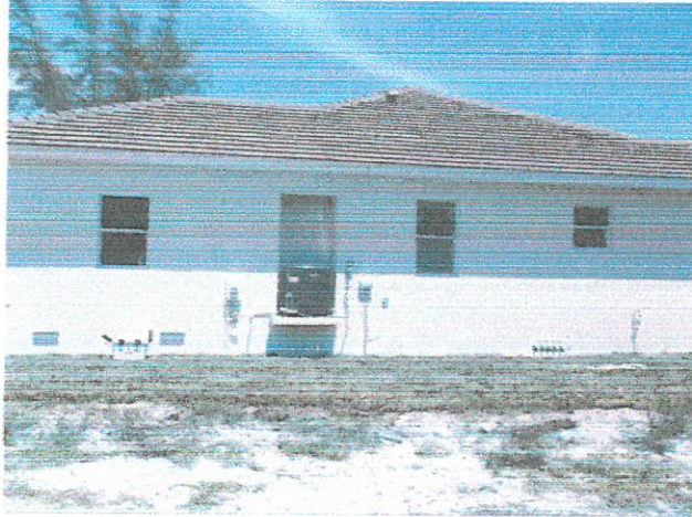
RIGHT SIDE 06-28-16 Image Field

If submitting more photographs than will fit on the preceding page, affix the additional photographs below. Identify all photographs with: date taken; "Front View" and "Rear View" and, if required, "Right Side View" and "Left Side View." When applicable, photographs must show the foundation with representative examples of the flood openings or vents, as indicated in Section A8.