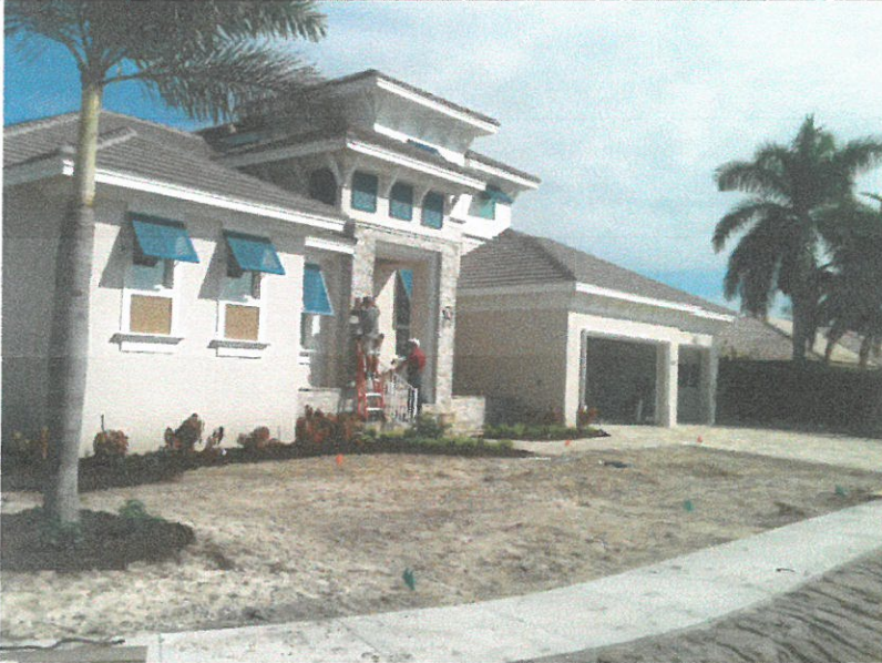
FRONT VIEW 11/11/15

If using the Elevation Certificate to obtain NFIP flood insurance, affix at least 2 building photographs below according to the instructions for Item A6. Identify all photographs with date taken; "Front View" and "Rear View"; and, if required, "Right Side View" and "Left Side View." When applicable, photographs must show the foundation with representative examples of the flood openings or vents, as indicated in Section A8. If submitting more photographs than will fit on this page, use the Continuation Page.