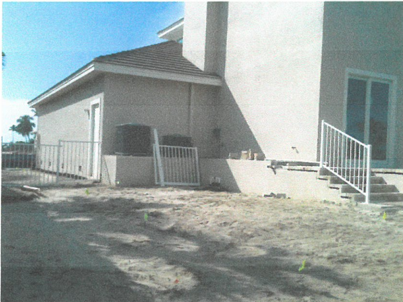
RIGHT SIDE VIEW 11/11/15