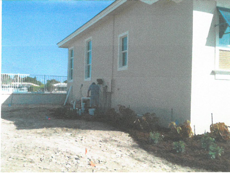
LEFT SIDE VIEW 11/11/15

If submitting more photographs than will fit on the preceding page, affix the additional photographs below. Identify all photographs with: date taken; "Front View" and "Rear View"; and, if required, "Right Side View" and "Left Side View." When applicable, photographs must show the foundation with representative examples of the flood openings or vents, as indicated in Section A8.