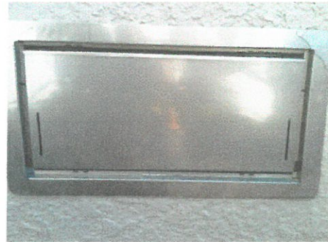
ENGINEERED FLOOD OPENING