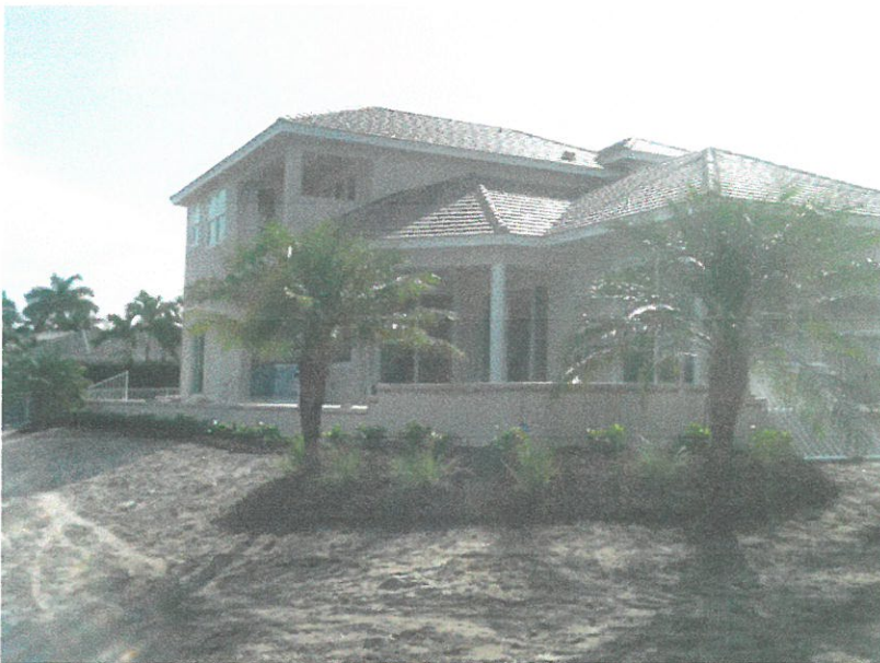
REAR VIEW 11/11/15