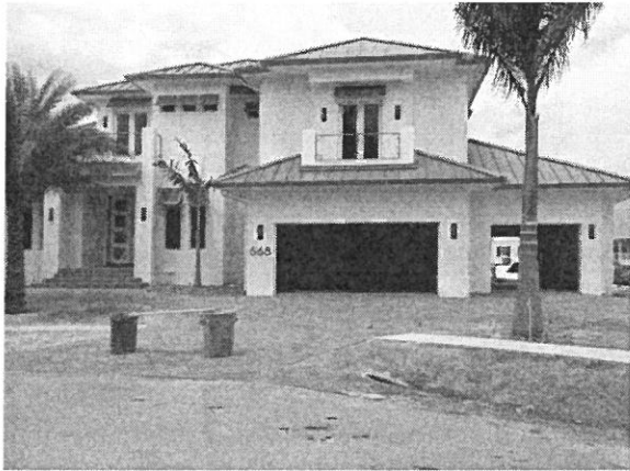
FRONT VIEW 4/20/16

If using the Elevation Certificate to obtain NFIP flood insurance, affix at least 2 building photographs below according to the instructions for Item A6. Identify all photographs with date taken; "Front view" and "Rear view"; and, if required, "Right Side View" and "Left Side View." When applicable, photographs must show the foundation with representative examples of the flood openings or vents, as indicated in Section A8. If submitting more photographs than will fit on this page, use the Continuation Page.