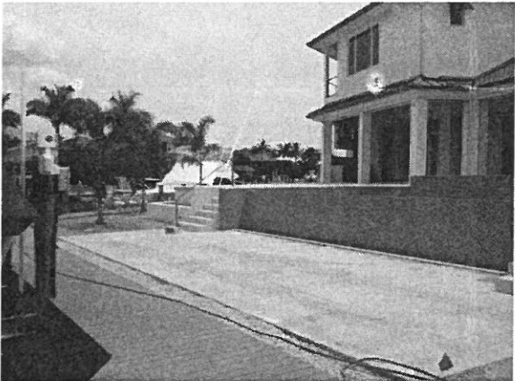
REAR VIEW 4/20/16