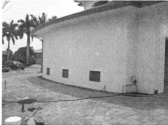
RIGHT SIDE VIEW 4/20/16