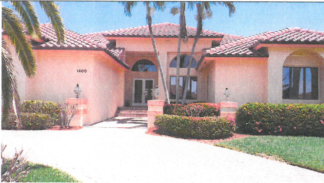
Front View: 06/06/2014

If using the Elevation Certificate to obtain NFIP flood insurance, affix at least 2 building photographs below according to the instructions for Item A6. Identify all photographs with date taken; "Front View" and "Rear View"; and, if required, "Right Side View" and "Left Side View." When applicable, photographs must show the foundation with representative examples of the flood openings or vents, as indicated in Section A8. If submitting more photographs than will fit on this page, use the Continuation Page.