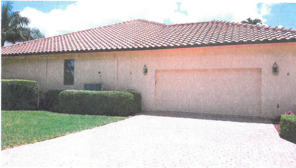
Side View: 06/06/2014