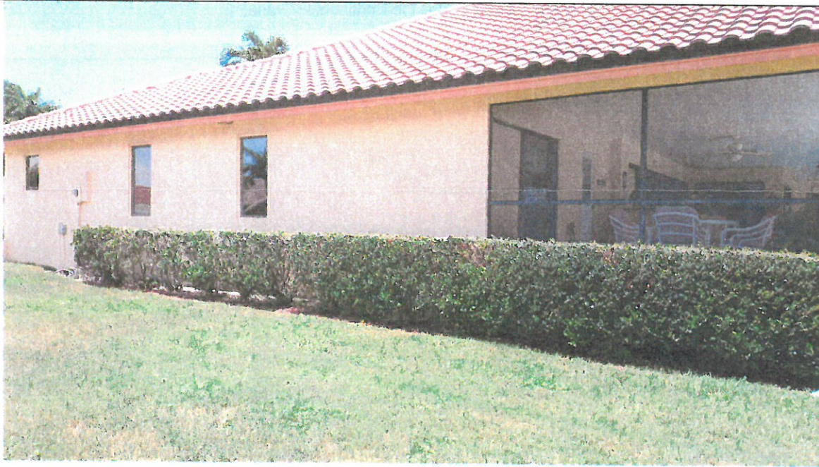
Side View: 06/06/2014

If submitting more photographs than will fit on the preceding page, affix the additional photographs below. Identify all photographs with: date taken; "Front View" and "Rear View"; and, if required, "Right Side View" and "Left Side View." When applicable, photographs must show the foundation with representative examples of the flood openings or vents, as indicated in Section A8.