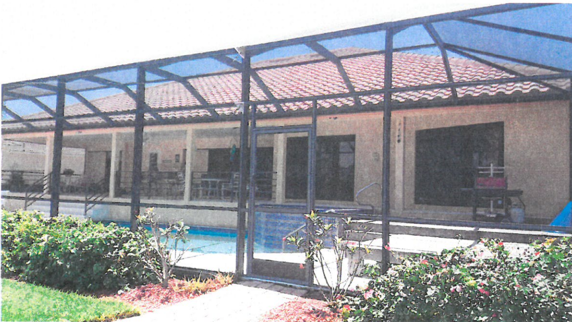
Rear View: 06/06/2014