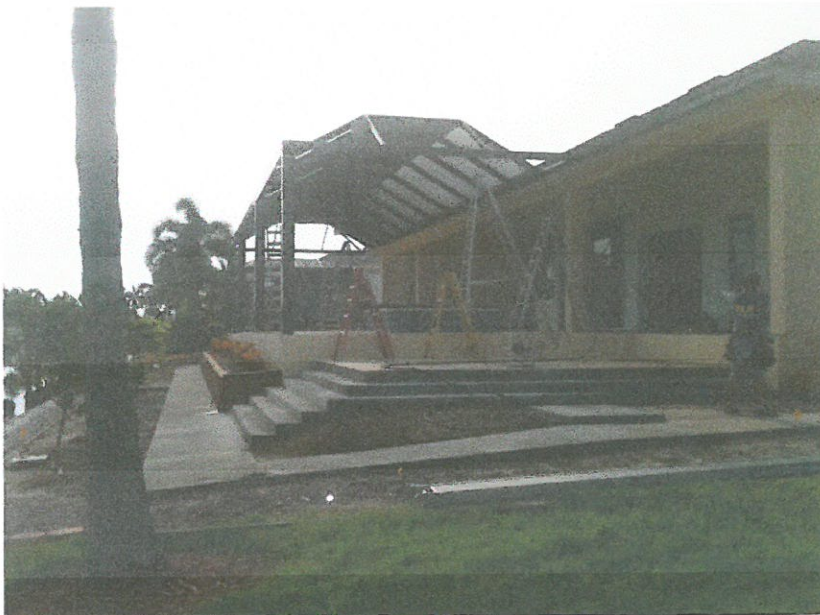
REAR VIEW 7/1/2014