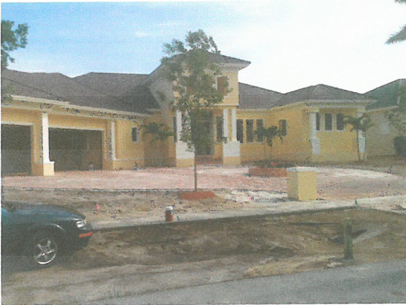
FRONT VIEW 7/1/2014

If using the Elevation Certificate to obtain NFIP flood insurance, affix at least 2 building photographs below according to the instructions for Item A6. Identify all photographs with date taken; "Front View" and "Rear View"; and, if required, "Right Side View" and "Left Side View." When applicable, photographs must show the foundation with representative examples of the flood openings or vents, as indicated in Section A8. If submitting more photographs than will fit on this page, use the Continuation Page.