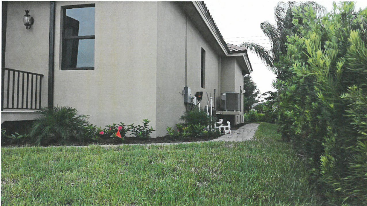
RIGHT SIDE VIEW – 06/13/2015