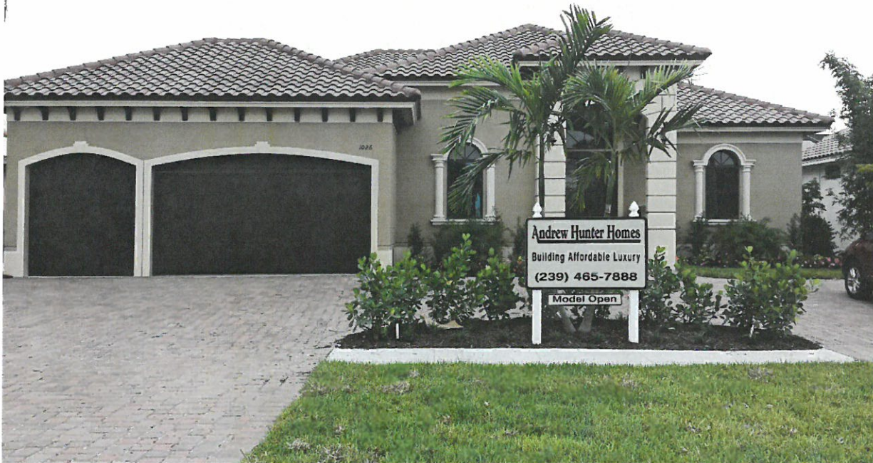
FRONT VIEW – 06/13/2015

If using the Elevation Certificate to obtain NFIP flood insurance, affix at least 2 building photographs below according to the instructions for Item A6. Identify all photographs with date taken; "Front View" and "Rear View"; and, if required, "Right Side View" and "Left Side View." When applicable, photographs must show the foundation with representative examples of the flood openings or vents, as indicated in Section A8. If submitting more photographs than will fit on this page, use the Continuation Page.