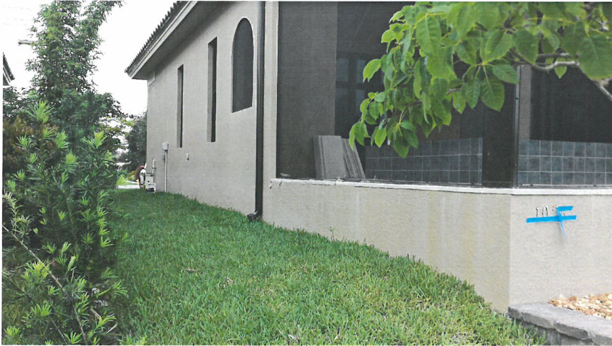
LEFT SIDE VIEW – 06/13/2015

If submitting more photographs than will fit on the preceding page, affix the additional photographs below. Identify all photographs with: date taken; "Front View" and "Rear View"; and, if required, "Right Side View" and "Left Side View." When applicable, photographs must show the foundation with representative examples of the flood openings or vents, as indicated in Section A8.