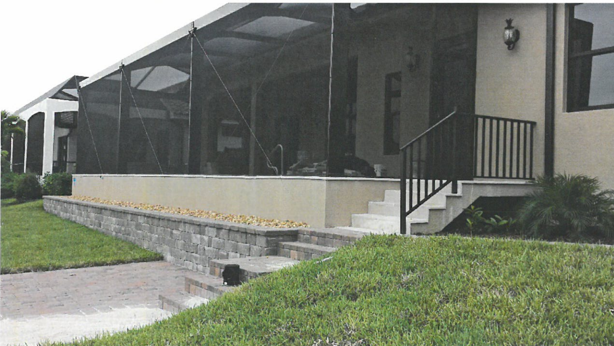
REAR VIEW – 06/13/2015