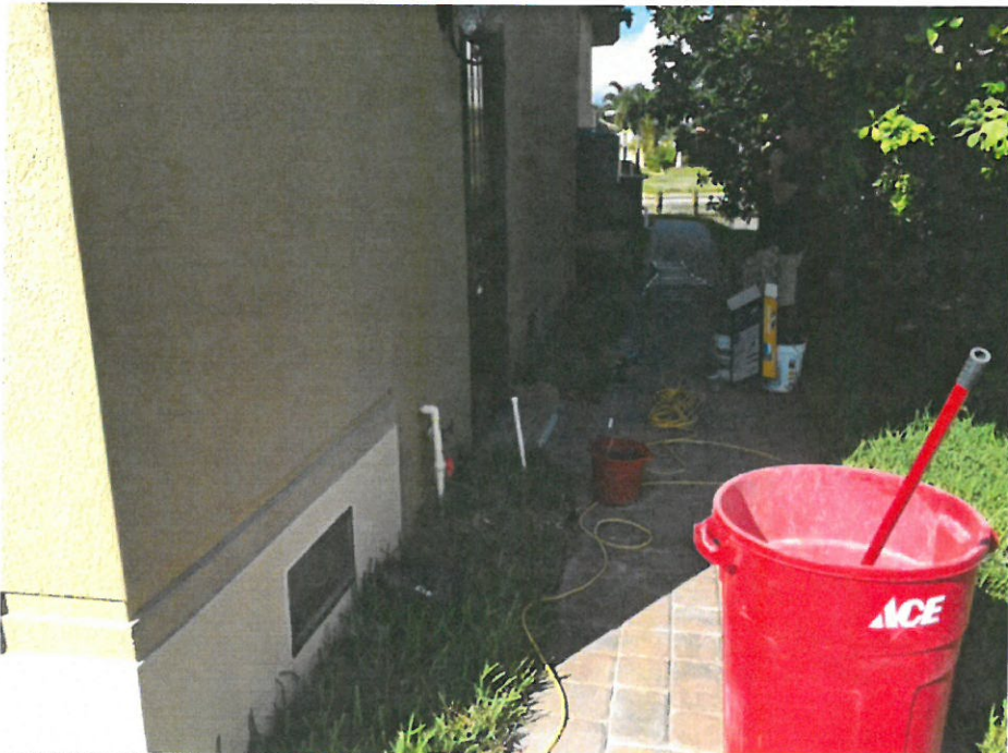
RIGHT SIDE VIEW – 11/20/2015