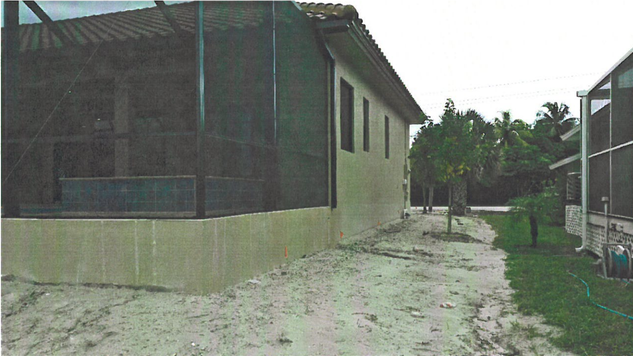
LEFT SIDE VIEW – 10/29/2015

If submitting more photographs than will fit on the preceding page, affix the additional photographs below. Identify all photographs with: date taken; "Front View" and "Rear View"; and, if required, "Right Side View" and "Left Side View." When applicable, photographs must show the foundation with representative examples of the flood openings or vents, as indicated in Section A8.