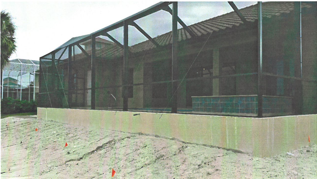
REAR VIEW – 10/29/2015