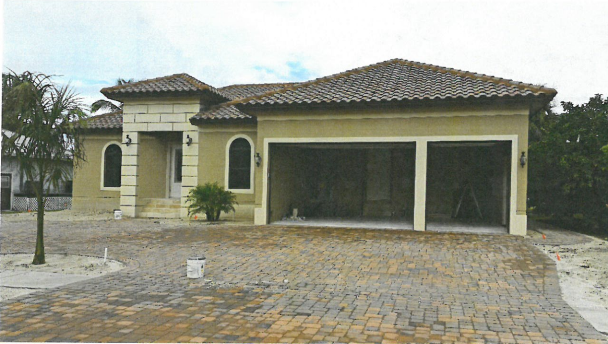
FRONT VIEW – 10/29/2015

If using the Elevation Certificate to obtain NFIP flood insurance, affix at least 2 building photographs below according to the instructions for Item A6. Identify all photographs with date taken; "Front View" and "Rear View"; and, if required, "Right Side View" and "Left Side View." When applicable, photographs must show the foundation with representative examples of the flood openings or vents, as indicated in Section A8. If submitting more photographs than will fit on this page, use the Continuation Page.