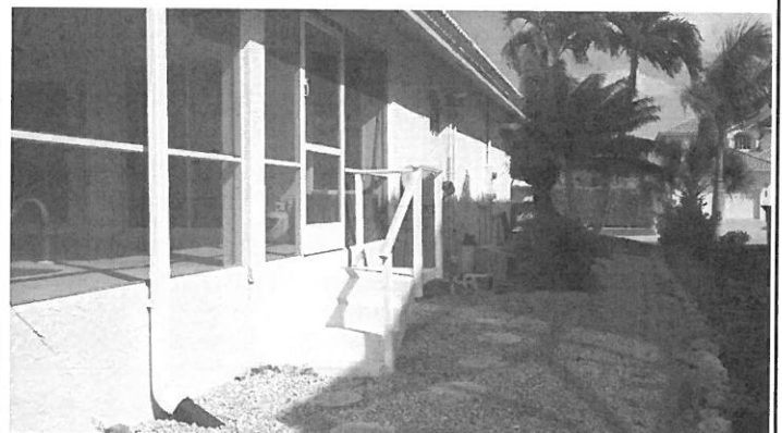
RIGHT PROPERTY PICTURE 2/6/2015