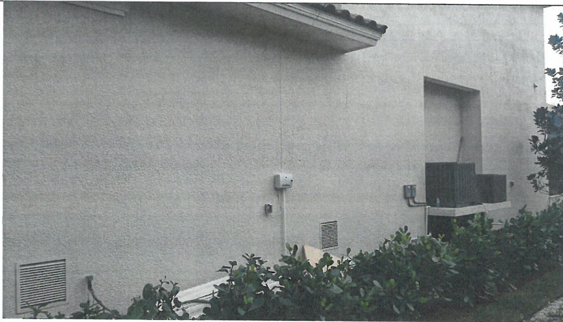
SIDE VIEW: 01/21/2015

If submitting more photographs than will fit on the preceding page, affix the additional photographs below. Identify all photographs with: date taken; "Front View" and "Rear View"; and, if required, "Right Side View" and "Left Side View." When applicable, photographs must show the foundation with representative examples of the flood openings or vents, as indicated in Section A8.