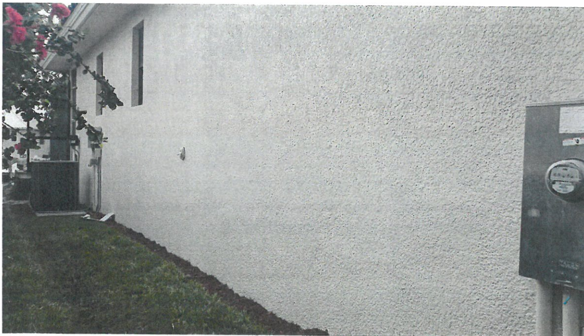
SIDE VIEW: 01/21/2015