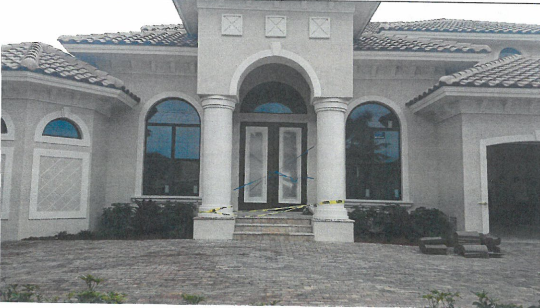
FRONT VIEW: 01/21/2015

If using the Elevation Certificate to obtain NFIP flood insurance, affix at least 2 building photographs below according to the instructions for Item A6. Identify all photographs with date taken; "Front View" and "Rear View"; and, if required, "Right Side View" and "Left Side View." When applicable, photographs must show the foundation with representative examples of the flood openings or vents, as indicated in Section A8. If submitting more photographs than will fit on this page, use the Continuation Page.