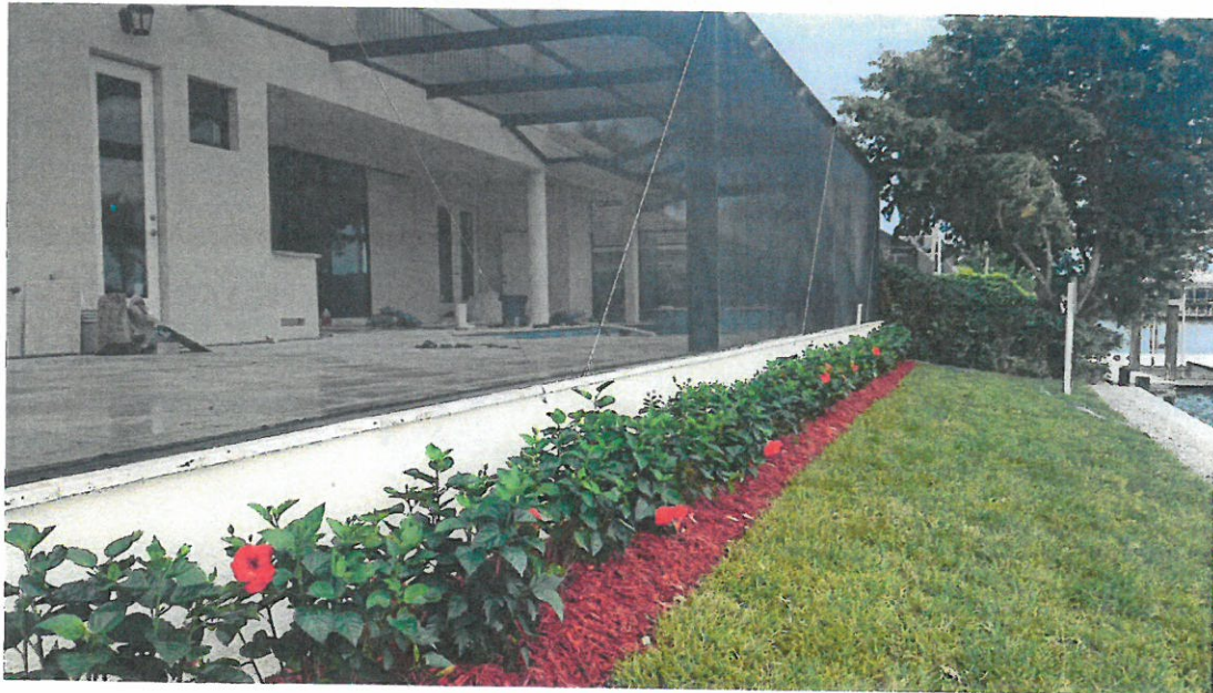
REAR VIEW: 01/21/2015