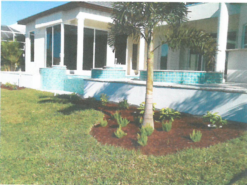
REAR VIEW 2/12/2014