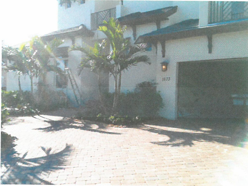
FRONT VIEW 2/12/2014

If using the Elevation Certificate to obtain NFIP flood insurance, affix at least 2 building photographs below according to the instructions for Item A6. Identify all photographs with date taken; "Front View" and "Rear View"; and, if required, "Right Side View" and "Left Side View." When applicable, photographs must show the foundation with representative examples of the flood openings or vents, as indicated in Section A8. If submitting more photographs than will fit on this page, use the Continuation Page.