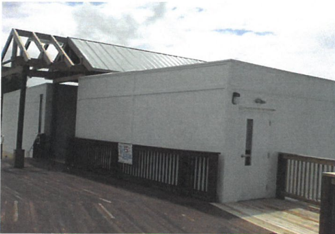
Front View 09/15/15