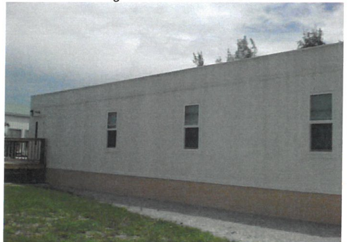
Right Side View 09/15/15