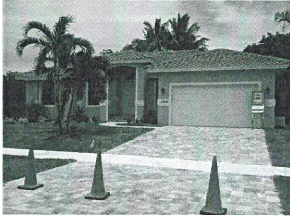
FRONT VIEW 6/10/16

If using the Elevation Certificate to obtain NFIP flood insurance, affix at least 2 building photographs below according to the instructions for Item A6. Identify all photographs with date taken; "Front view" and "Rear view"; and, if required, "Right Side View" and "Left Side View." When applicable, photographs must show the foundation with representative examples of the flood openings or vents, as indicated in Section A8. If submitting more photographs than will fit on this page, use the Continuation Page.