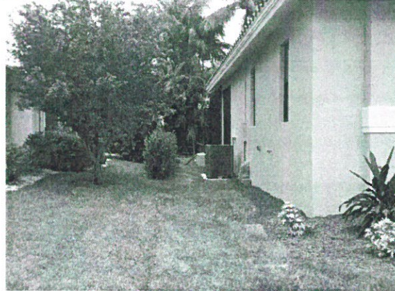
LEFT SIDE 6/10/16