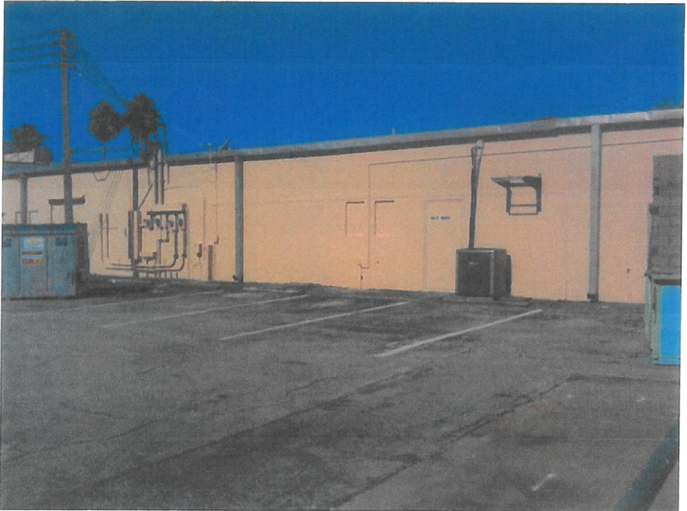
Rear View 12/19/11