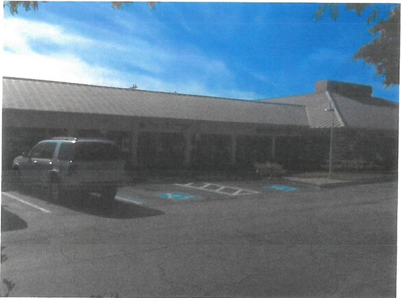
Front View 12/19/11

If using the Elevation Certificate to obtain NFIP flood insurance, affix at least two building photographs below according to the instructions for Item A6. Identify all photographs with: date taken; "Front View" and "Rear View"; and, if required, "Right Side View" and "Left Side View." If submitting more photographs than will fit on this page, use the Continuation Page on the reverse.