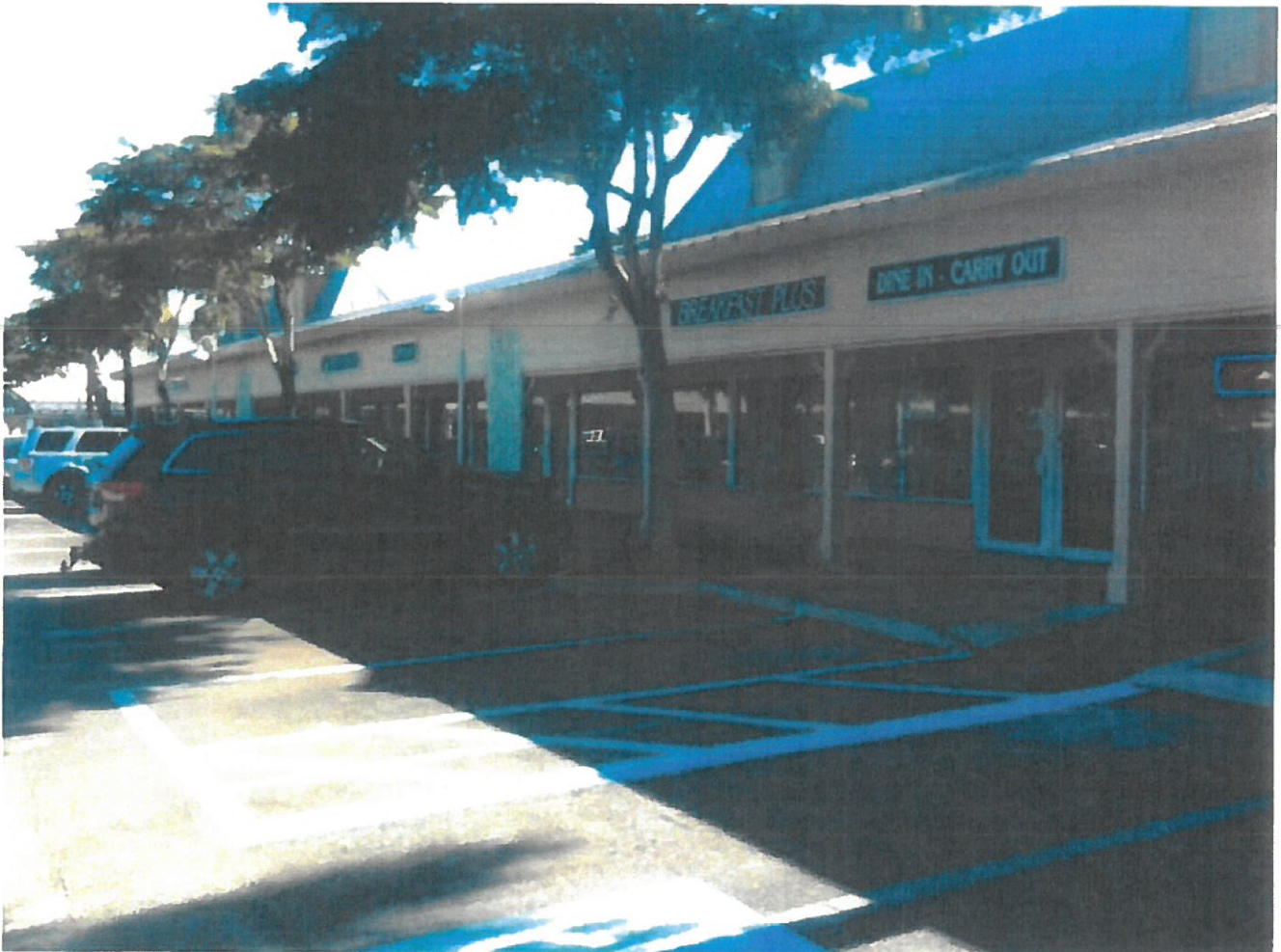
Front View 12/19/11