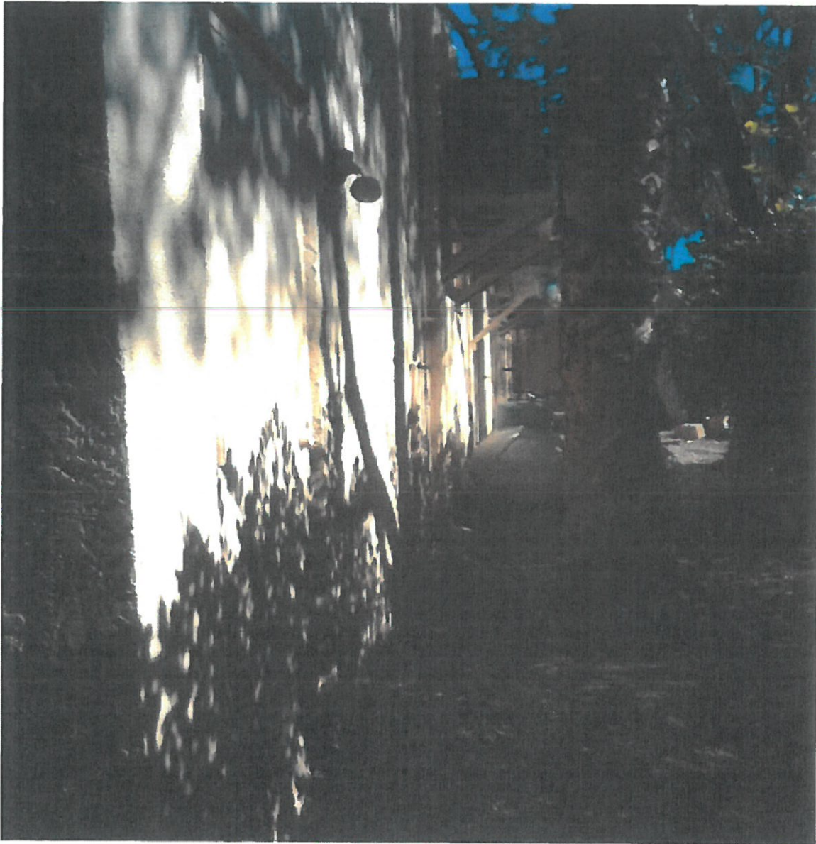
Rear View 12/19/11