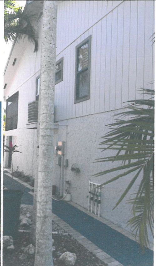
Side View (10/9/2014)