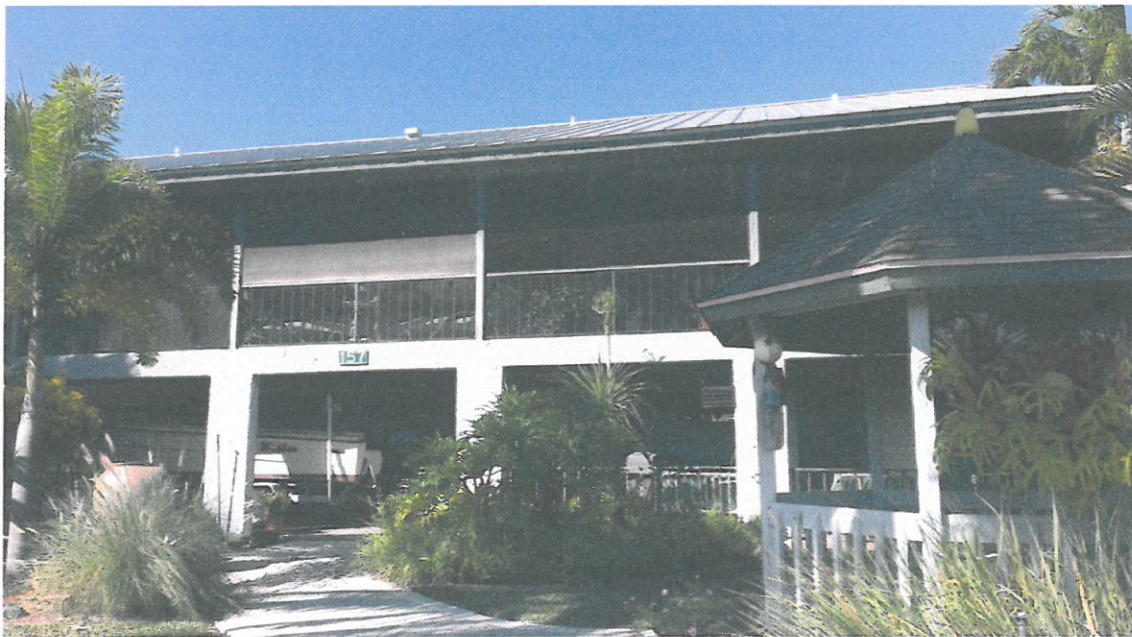
Rear View (10/9/2014)