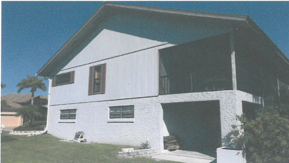
Side View (10/9/2014)

If using the Elevation Certificate to obtain NFIP flood insurance, affix at least 2 building photographs below according to the instructions for Item A6. Identify all photographs with date taken; "Front View" and "Rear View"; and, if required, "Right Side View" and "Left Side View." When applicable, photographs must show the foundation with representative examples of the flood openings or vents, as indicated in Section A8. If submitting more photographs than will fit on this page, use the Continuation Page.