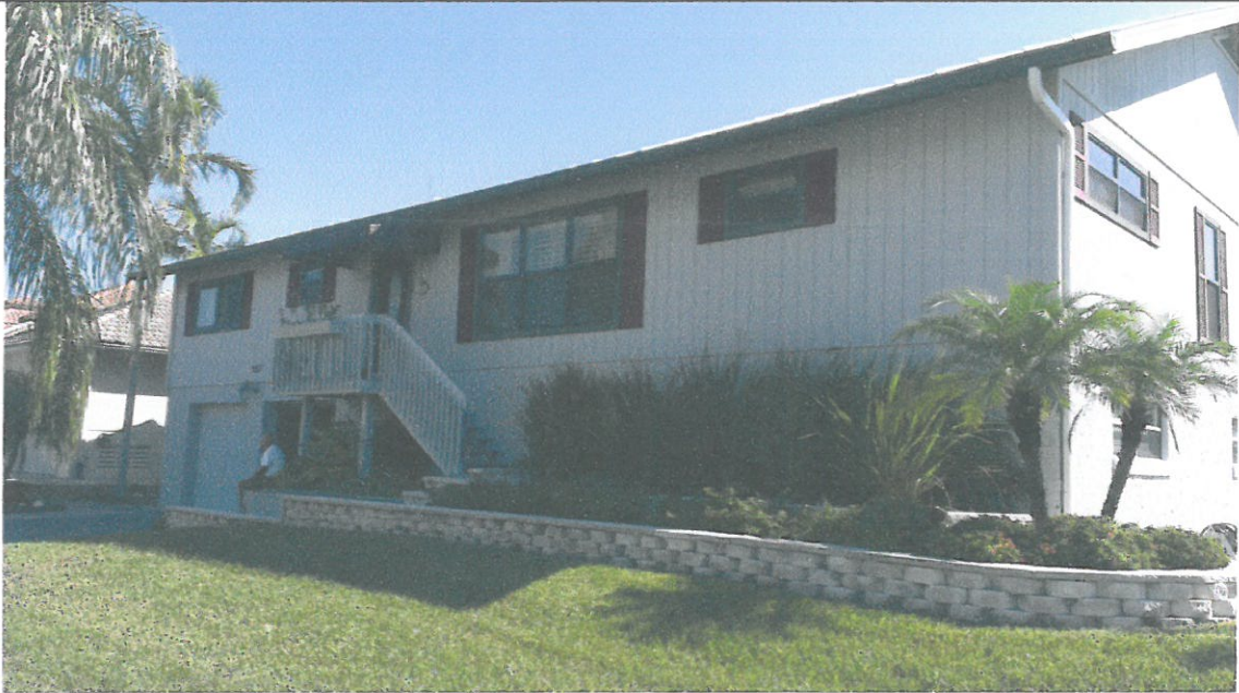
Front View (10/9/2014)

If using the Elevation Certificate to obtain NFIP flood insurance, affix at least 2 building photographs below according to the instructions for Item A6. Identify all photographs with date taken; "Front View" and "Rear View"; and, if required, "Right Side View" and "Left Side View." When applicable, photographs must show the foundation with representative examples of the flood openings or vents, as indicated in Section A8. If submitting more photographs than will fit on this page, use the Continuation Page.