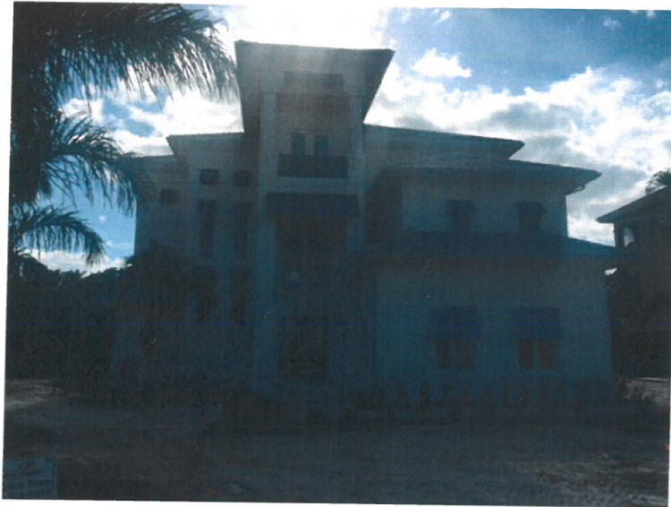
FRONT VIEW DATE TAKEN: 11/24/15

If using the Elevation Certificate to obtain NFIP flood insurance, affix at least 2 building photographs below according to the instructions for Item A6. Identify all photographs with date taken; "Front View" and "Rear View"; and, if required, "Right Side View" and "Left Side View." When applicable, photographs must show the foundation with representative examples of the flood openings or vents, as indicated in Section A8. If submitting more photographs than will fit on this page, use the Continuation Page.