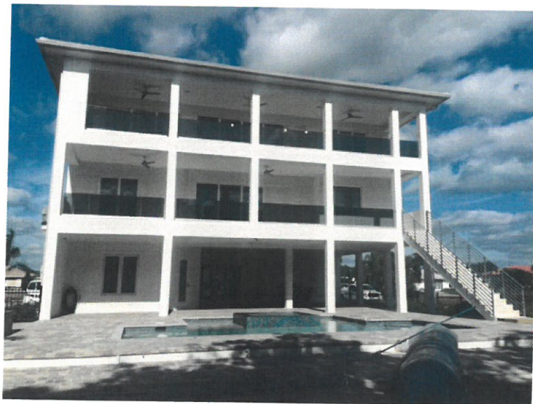
REAR VIEW DATE TAKEN: 11/24/15