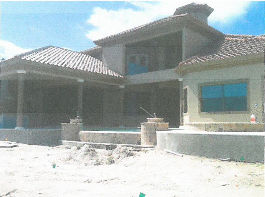
REAR VIEW 4/19/14