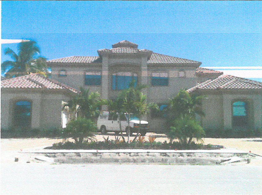
FRONT VIEW 4/19/14

If using the Elevation Certificate to obtain NFIP flood insurance, affix at least 2 building photographs below according to the instructions for Item A6. Identify all photographs with date taken; "Front View" and "Rear View"; and, if required, "Right Side View" and "Left Side View." When applicable, photographs must show the foundation with representative examples of the flood openings or vents, as indicated in Section A8. If submitting more photographs than will fit on this page, use the Continuation Page.