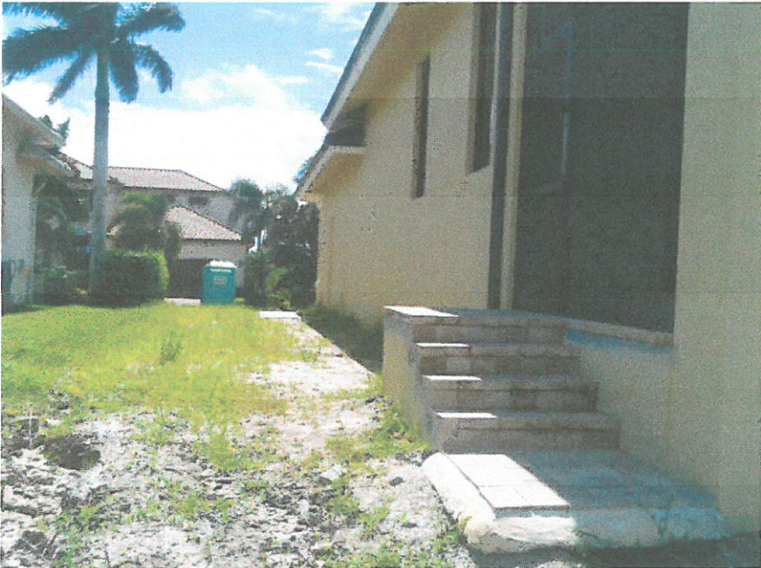
RIGHT SIDE VIEW 9/30/15