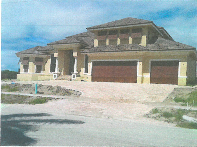
FRONT VIEW 9/30/15

If using the Elevation Certificate to obtain NFIP flood insurance, affix at least 2 building photographs below according to the instructions for Item A6. Identify all photographs with date taken; "Front View" and "Rear View"; and, if required, "Right Side View" and "Left Side View." When applicable, photographs must show the foundation with representative examples of the flood openings or vents, as indicated in Section A8. If submitting more photographs than will fit on this page, use the Continuation Page.