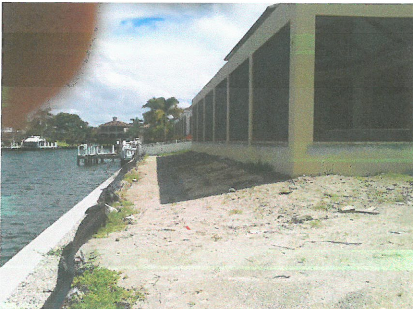
REAR VIEW 9/30/15