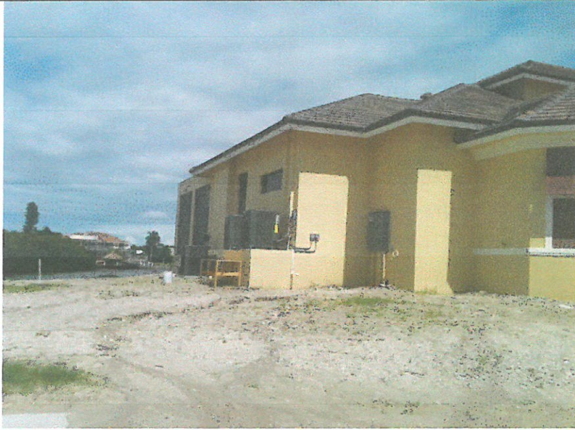
LEFT SIDE VIEW 9/30/15

If submitting more photographs than will fit on the preceding page, affix the additional photographs below. Identify all photographs with: date taken; "Front View" and "Rear View"; and, if required, "Right Side View" and "Left Side View." When applicable, photographs must show the foundation with representative examples of the flood openings or vents, as indicated in Section A8.