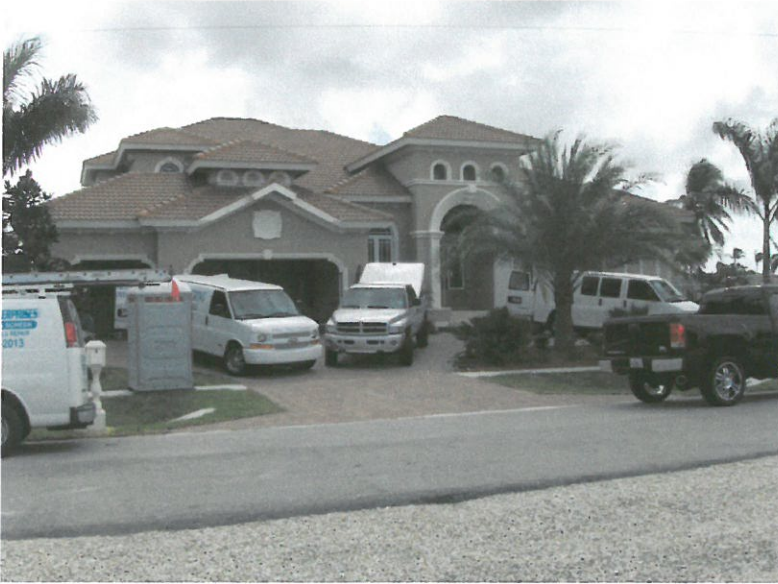
Front View 10/13/2008

If using the Elevation Certificate to obtain NFIP flood insurance, affix at least two building photographs below according to the instructions for Item A6. Identify all photographs with: date taken; "Front View" and "Rear View"; and, if required, "Right Side View" and "Left Side View." If submitting more photographs than will fit on this page, use the Continuation Page, following.