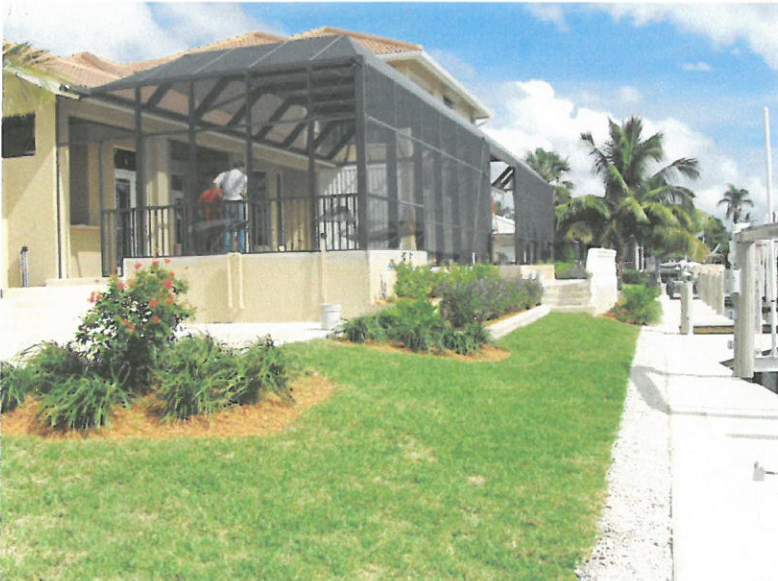
Rear View 10/13/2008