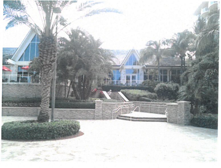
Rear View 2 Date Taken: 10/7/15