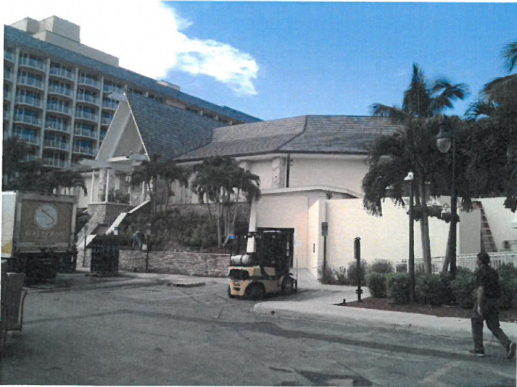
Front View 1 Date Taken: 10/7/15