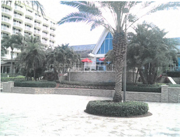
Rear View 1 Date Taken: 10/7/15