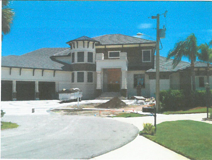
FRONT VIEW 6/19/15

If using the Elevation Certificate to obtain NFIP flood insurance, affix at least 2 building photographs below according to the instructions for Item A6. Identify all photographs with date taken, "Front View" and "Rear View"; and, if required, "Right Side View" and "Left Side View." When applicable, photographs must show the foundation with representative examples of the flood openings or vents, as indicated in Section A8. If submitting more photographs than will fit on this page, use the Continuation Page.