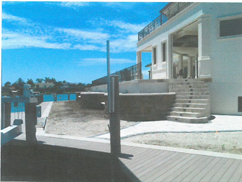
REAR VIEW 6/19/15