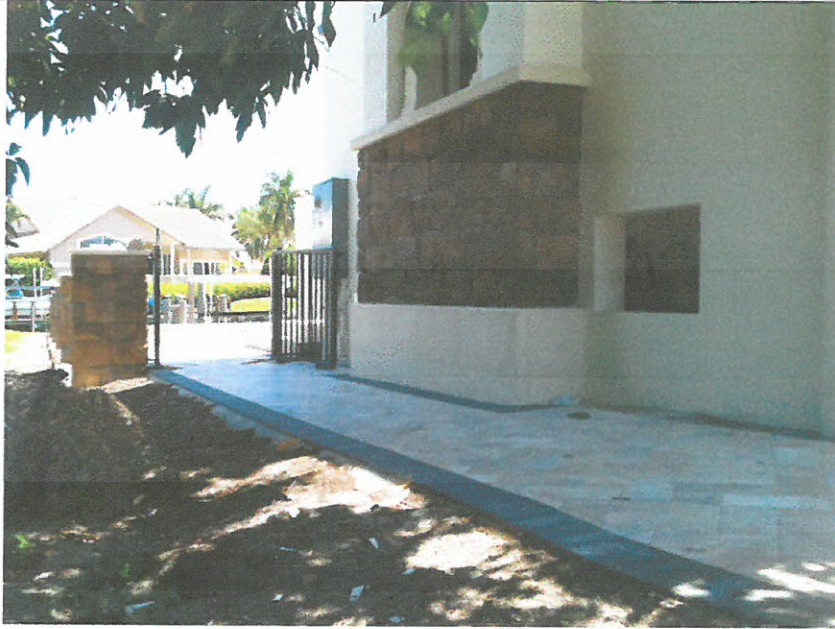
LEFT SIDE VIEW 6/19/15

If submitting more photographs than will fit on the preceding page, affix the additional photographs below. Identify all photographs with: date taken; "Front View" and "Rear View"; and, if required, "Right Side View" and "Left Side View." When applicable, photographs must show the foundation with representative examples of the flood openings or vents, as indicated in Section A8.