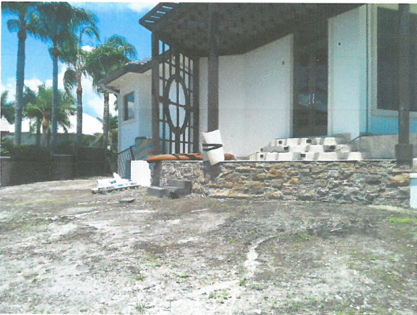
RIGHT SIDE VIEW 6/19/15