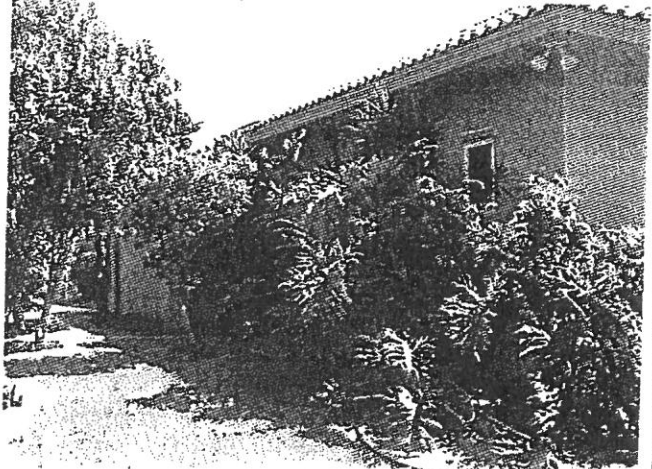
Side View (East Side)