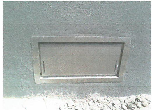
520 SMART VENT