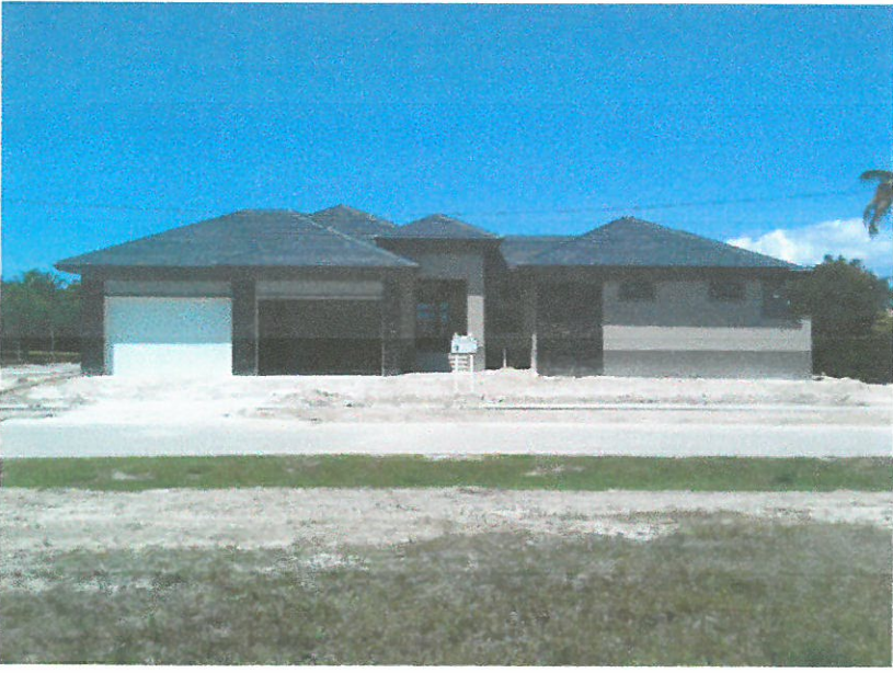
RIGHT SIDE VIEW 4/4/15