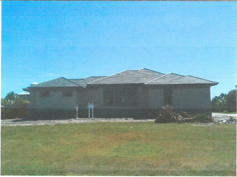
LEFT SIDE VIEW 4/4/15

If submitting more photographs than will fit on the preceding page, affix the additional photographs below. Identify all photographs with: date taken; "Front View" and "Rear View"; and, if required, "Right Side View" and "Left Side View." When applicable, photographs must show the foundation with representative examples of the flood openings or vents, as indicated in Section A8.