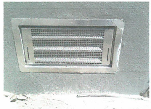
510 SMART VENT