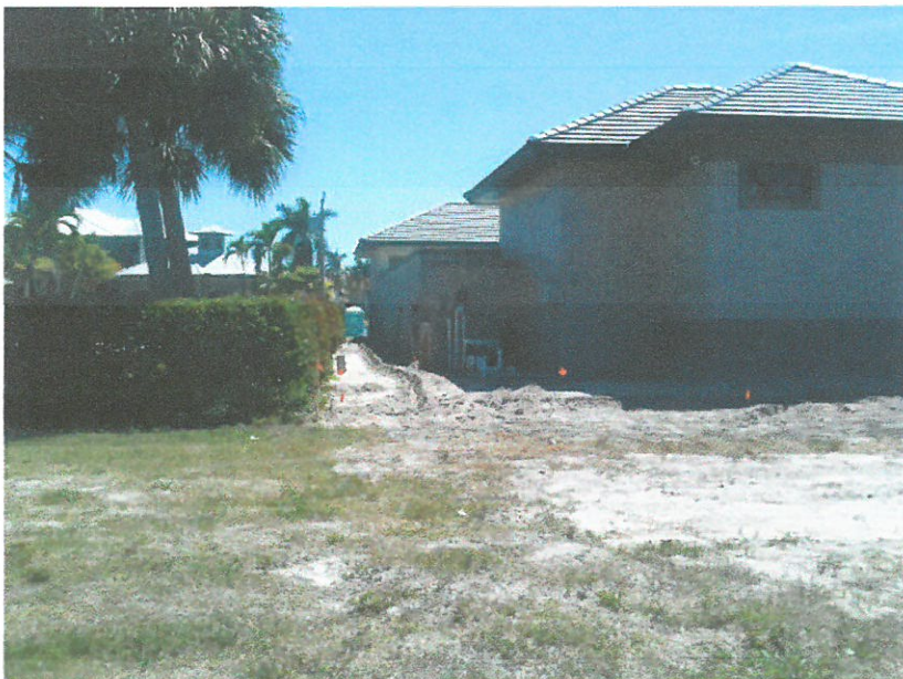
REAR VIEW 4/4/15