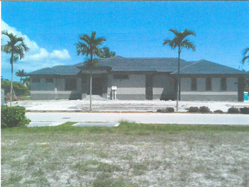
FRONT VIEW 4/4/15

If using the Elevation Certificate to obtain NFIP flood insurance, affix at least 2 building photographs below according to the instructions for Item A6. Identify all photographs with date taken; "Front View" and "Rear View"; and, if required, "Right Side View" and "Left Side View." When applicable, photographs must show the foundation with representative examples of the flood openings or vents, as indicated in Section A8. If submitting more photographs than will fit on this page, use the Continuation Page.