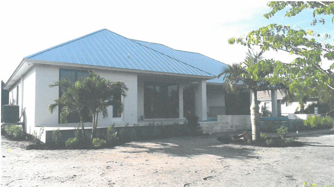
Rear View (1/23/2015)