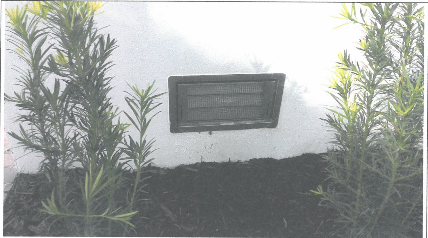
Typical Flood Opening (1/23/2015)

If using the Elevation Certificate to obtain NFIP flood insurance, affix at least 2 building photographs below according to the instructions for Item A6. Identify all photographs with date taken; "Front View" and "Rear View"; and, if required, "Right Side View" and "Left Side View." When applicable, photographs must show the foundation with representative examples of the flood openings or vents, as indicated in Section A8. If submitting more photographs than will fit on this page, use the Continuation Page.