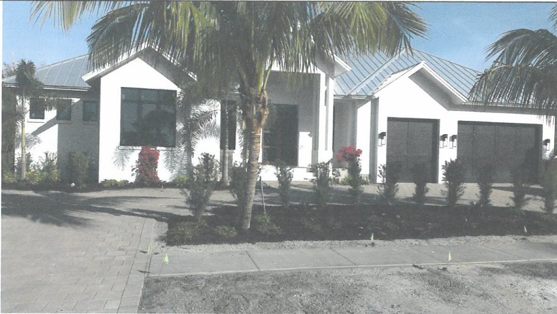
Front View (1/23/2015)

If using the Elevation Certificate to obtain NFIP flood insurance, affix at least 2 building photographs below according to the instructions for Item A6. Identify all photographs with date taken; "Front View" and "Rear View"; and, if required, "Right Side View" and "Left Side View." When applicable, photographs must show the foundation with representative examples of the flood openings or vents, as indicated in Section A8. If submitting more photographs than will fit on this page, use the Continuation Page.