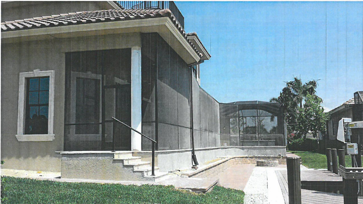
REAR VIEW – 04/27/2015