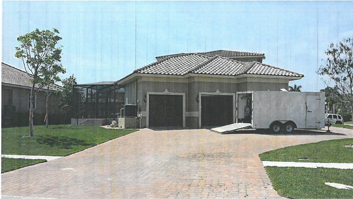
LEFT SIDE VIEW – 04/27/2015

If submitting more photographs than will fit on the preceding page, affix the additional photographs below. Identify all photographs with: date taken; "Front View" and "Rear View"; and, if required, "Right Side View" and "Left Side View." When applicable, photographs must show the foundation with representative examples of the flood openings or vents, as indicated in Section A8.