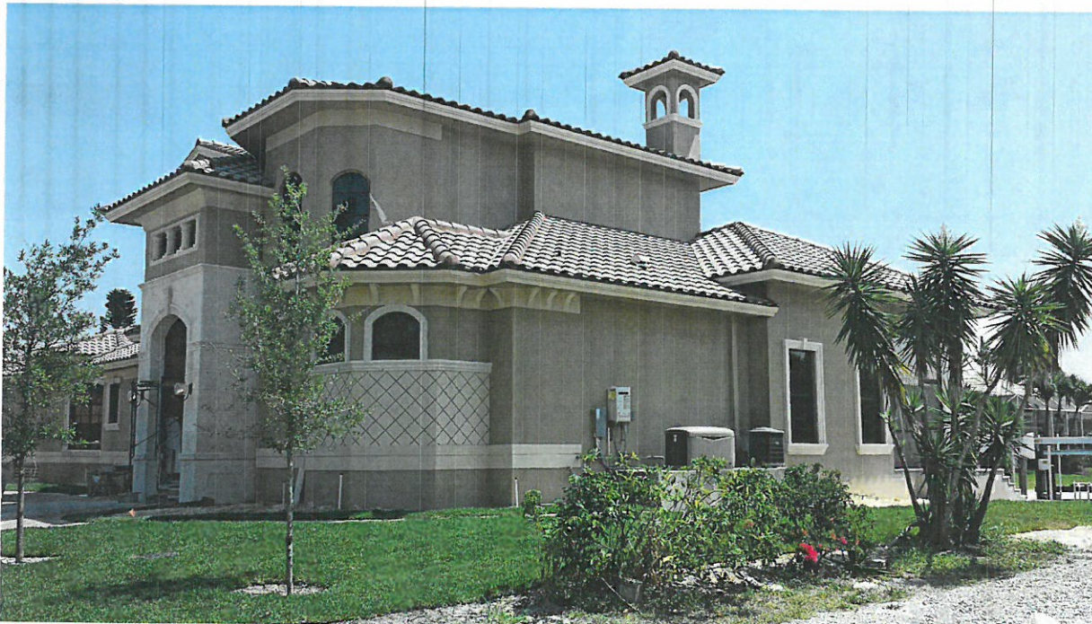
RIGHT SIDE VIEW - 04/27/2015