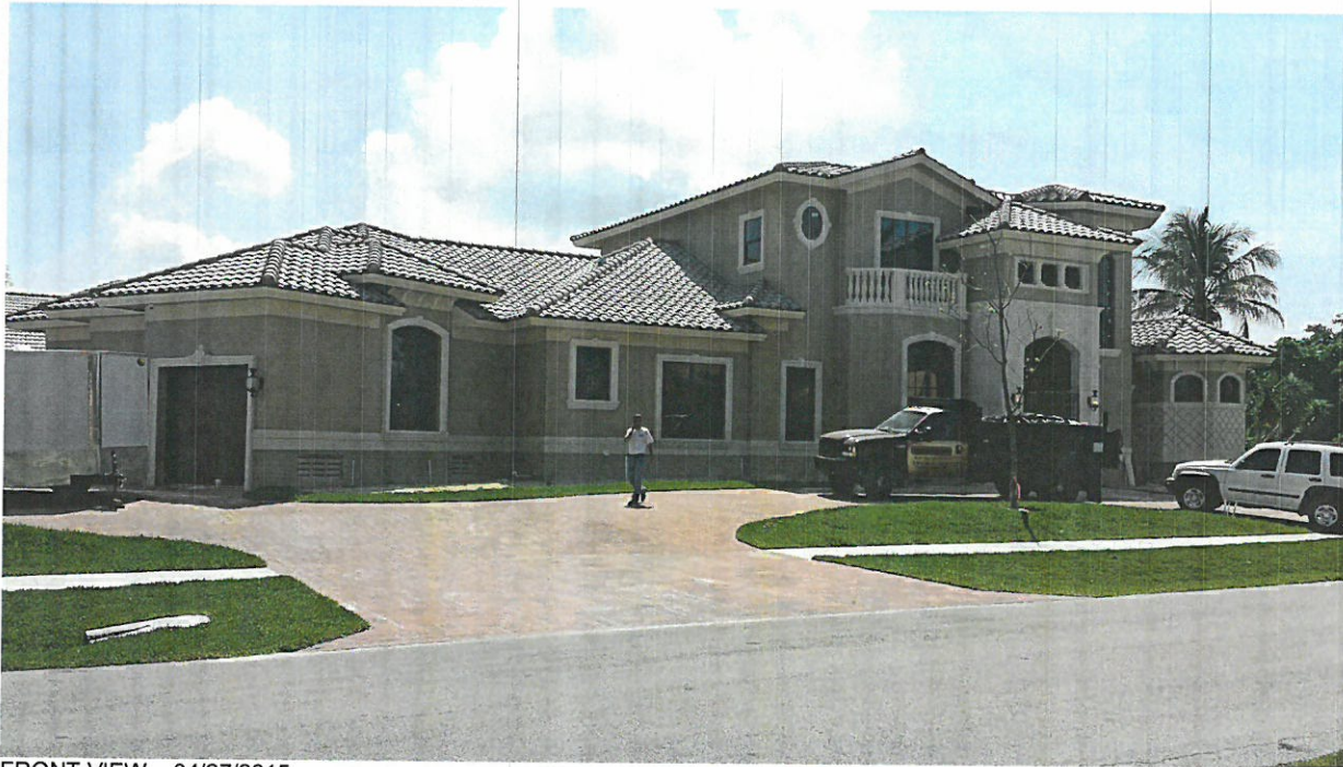
FRONT VIEW - 04/27/2015

If using the Elevation Certificate to obtain NFIP flood insurance, affix at least 2 building photographs below according to the instructions for Item A6. Identify all photographs with date taken; "Front View" and "Rear View"; and, if required, "Right Side View" and "Left Side View." When applicable, photographs must show the foundation with representative examples of the flood openings or vents, as indicated in Section A8. If submitting more photographs than will fit on this page, use the Continuation Page.